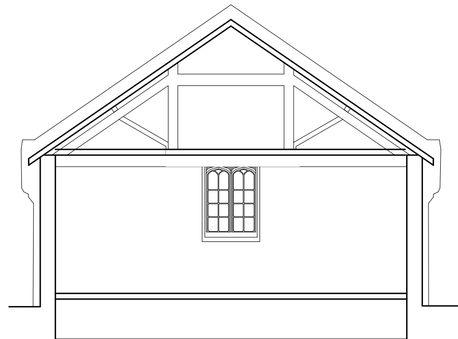
SECTION C - C