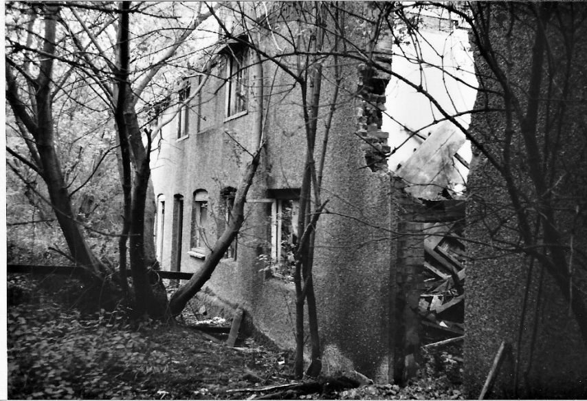
NORTHAW WORKHOUSE in a state of dereliction 1986