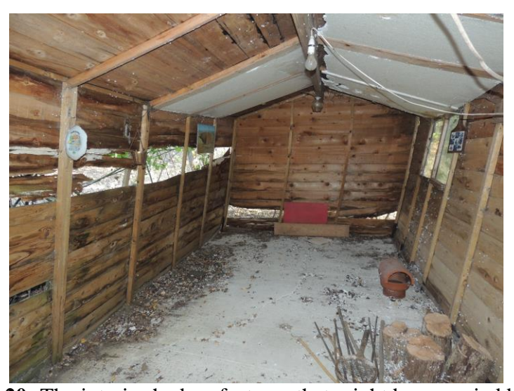
Photo 20: The interior had no features that might be occupied by bats