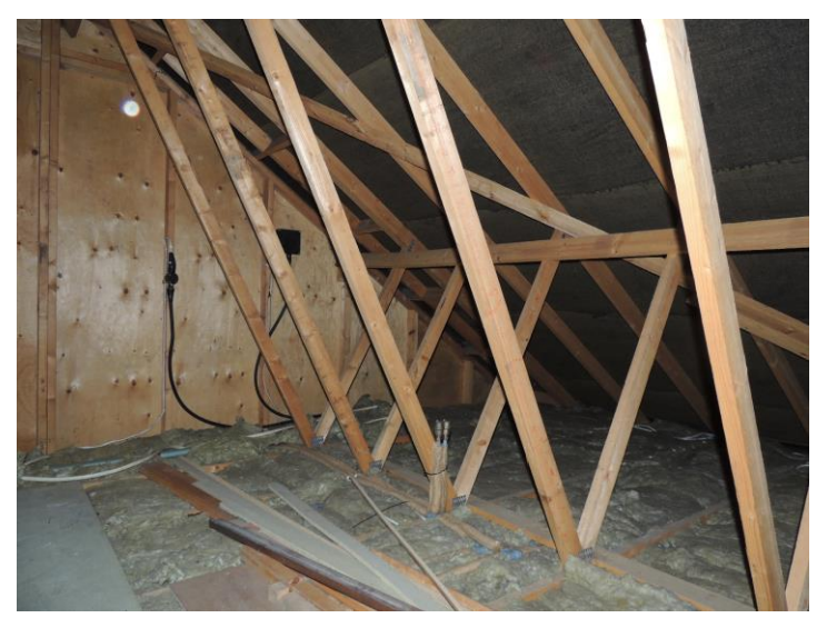
Photo 7: Note cluttered roof and lack of evidence of bats on floor of loft