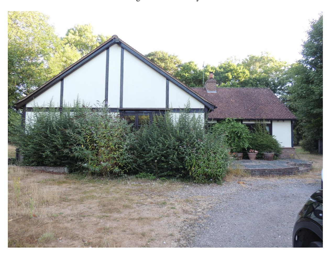
Photo 1: Front (southern) elevation. The proposal is to demolish and replace the building

As part of a planning proposal involving a residential property at Postern Gate Farm, Newgate Street, Hertford, Hertfordshire SG13 8QR, a site visit was conducted on 14<sup>th</sup> August 2022 to determine whether the building had been used by bats.