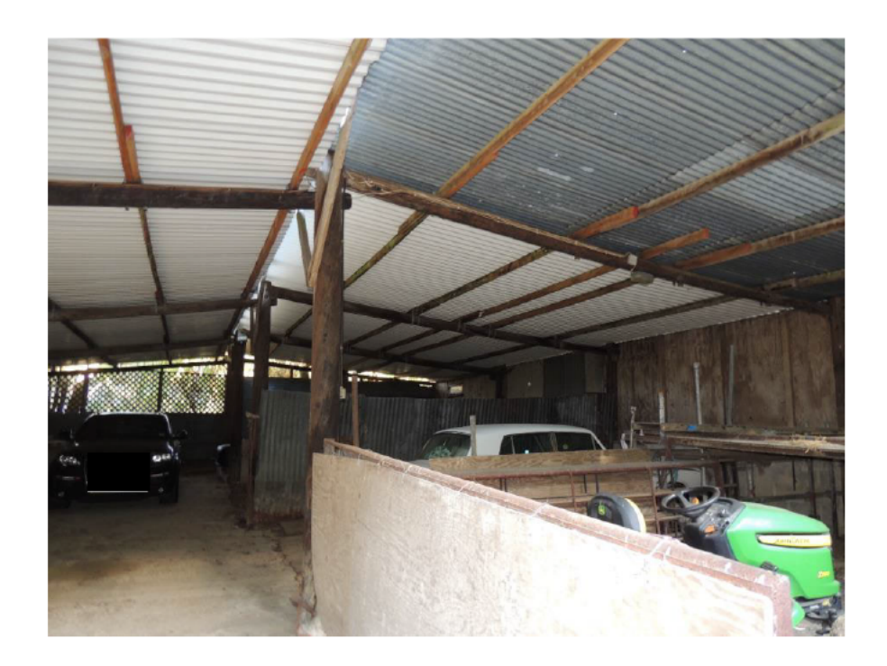
Photo 24: The interior had no features that might be occupied by bats

There is no vegetation affected by the project that has crevices, loose bark or woodpecker holes that might be colonised by bats.