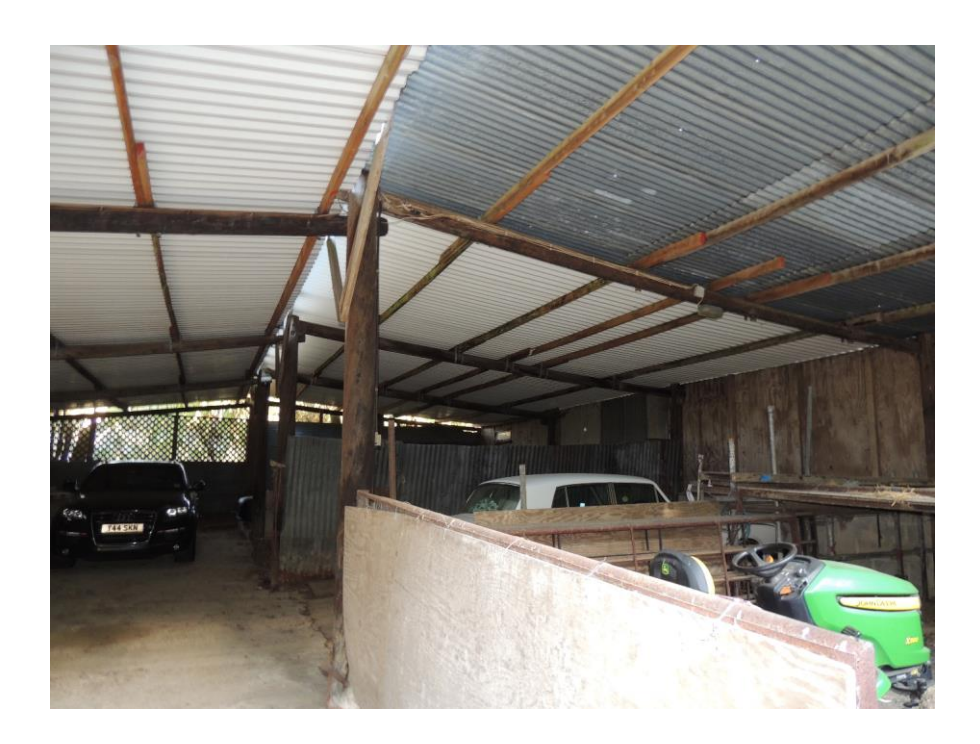
Photo 24: The interior had no features that might be occupied by bats

There is no vegetation affected by the project that has crevices, loose bark or woodpecker holes that might be colonised by bats.