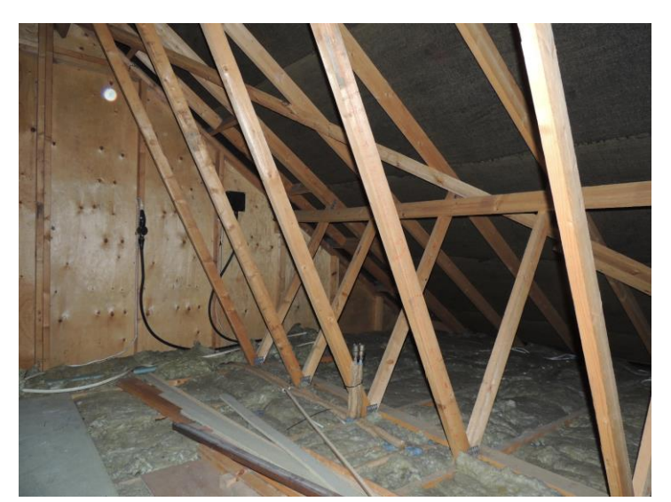
Photo 7: Note cluttered roof and lack of evidence of bats on floor of loft