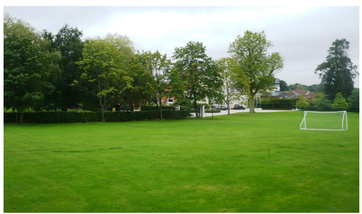
Photo 03 – View from the proposed tennis court location looking back towards the house.

It is proposed to construct a hard surfaced tennis court with open mesh fencing within a discreet and well screened lawned area away from the setting of the house.