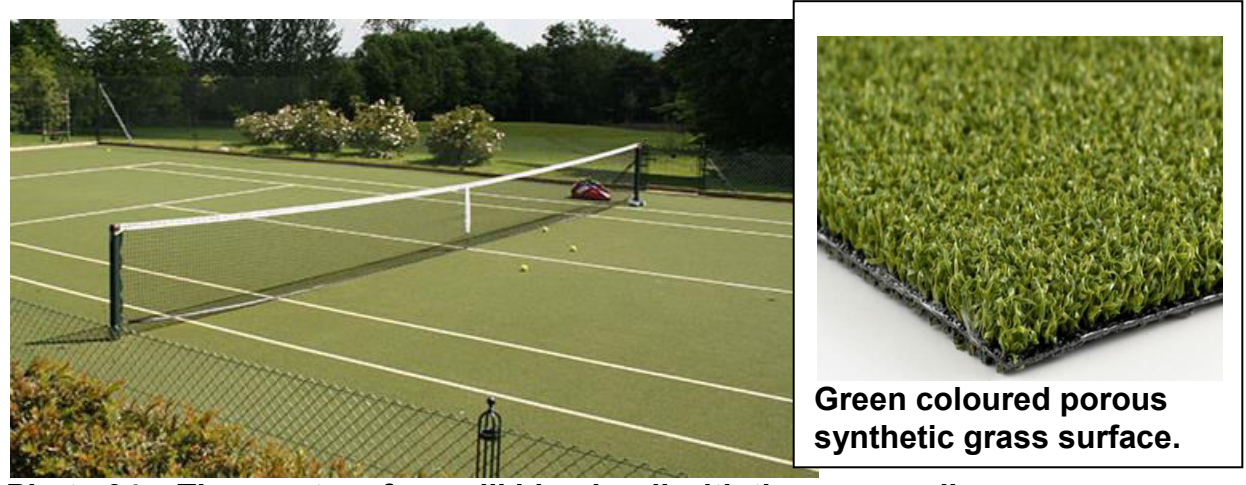
Photo 04 – The court surface will blend well with the surroundings

The design of the proposed tennis court is described in more detail in the accompanying Design & Access Statement and the associated drawings (see Figures 1 to 6). The court has been designed to ensure that it would be as inconspicuous as possible in an area of the grounds that is screened by existing soft landscaping. The green synthetic grass surface would blend well with the adjacent lawned areas. The open mesh dark fencing would be the standard 2.75 metres high at each end but reduced to a height of only 0.9 metres along both sides. The sensitive design would therefore be in keeping with the surroundings and ensure no visual impact.