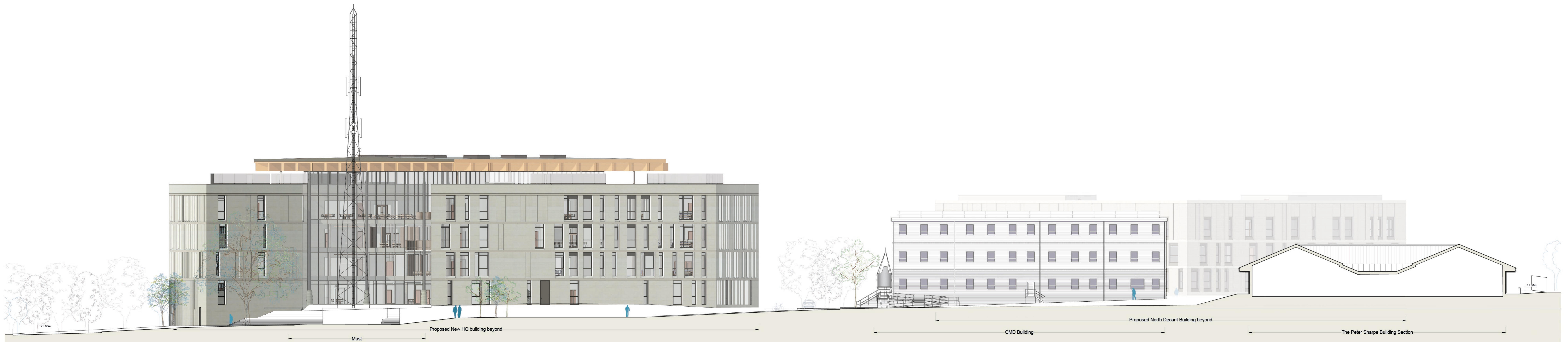
Street Elevation 6 - Facing Northwest