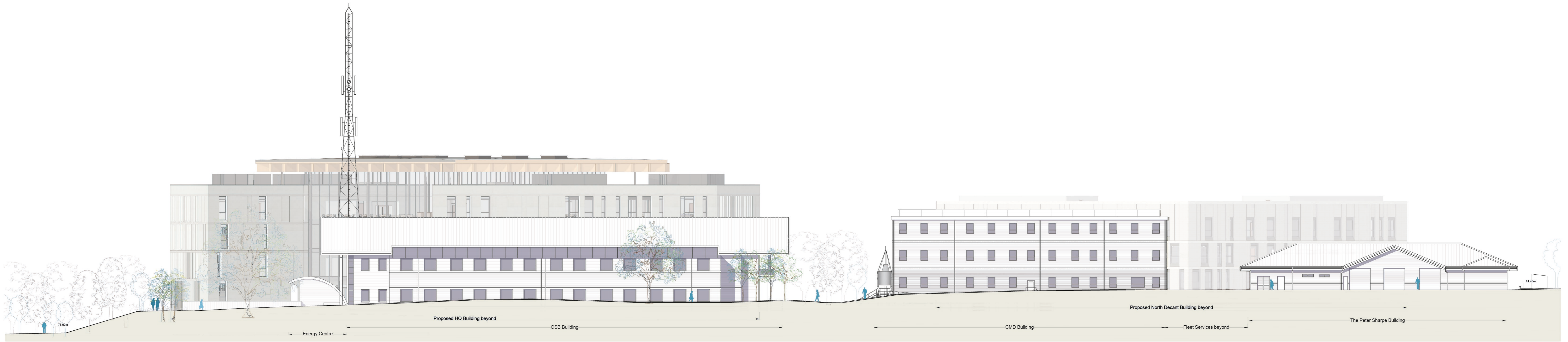
Street Elevation 5 - Facing Northwest