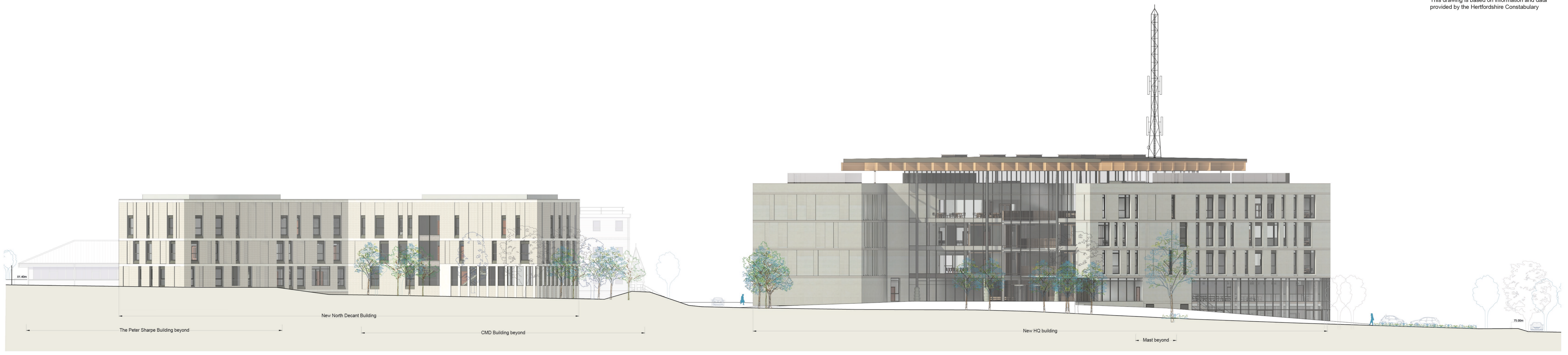
Street Elevation 3 - Facing Southeast