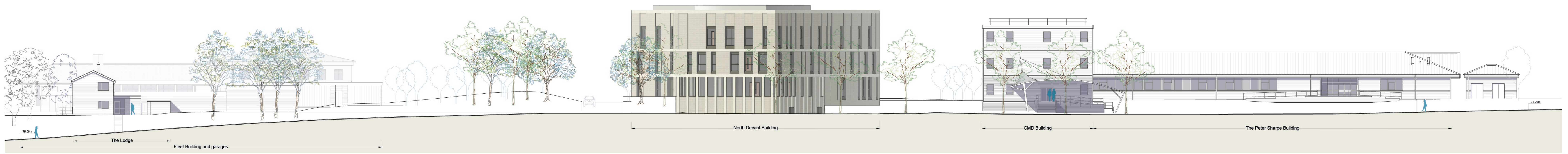
Street Elevation 4 - Facing Northeast