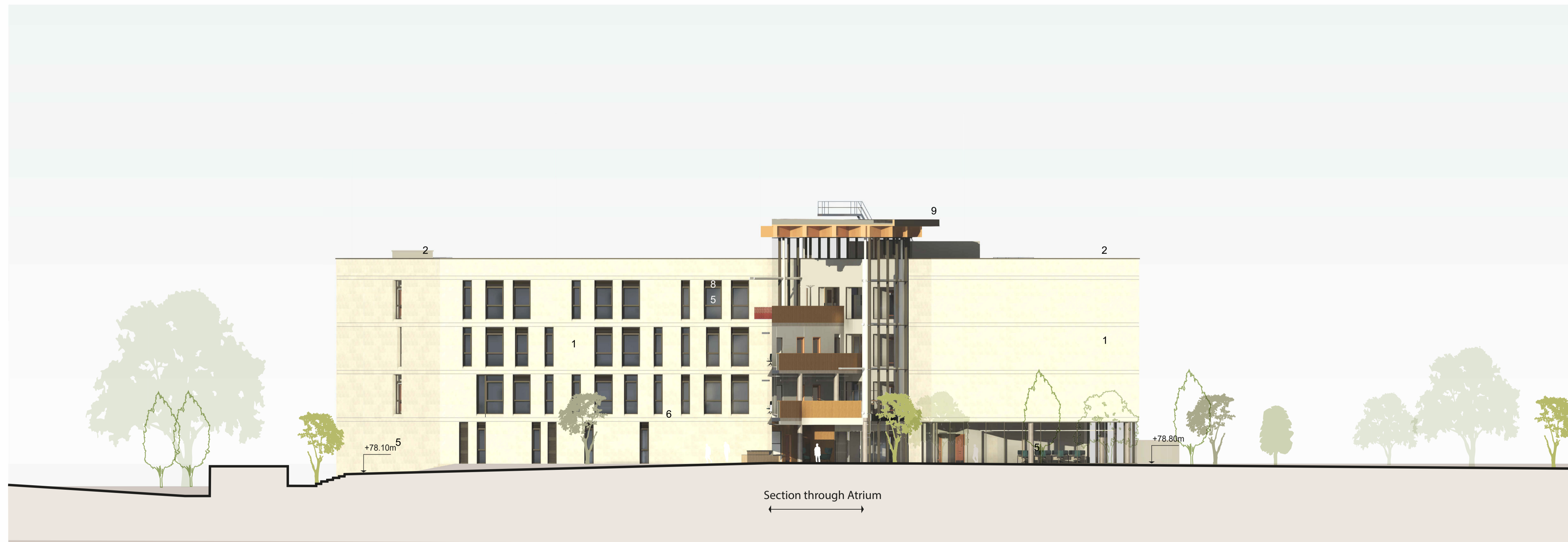
8 - South Wing - North Elevation 1 : 200