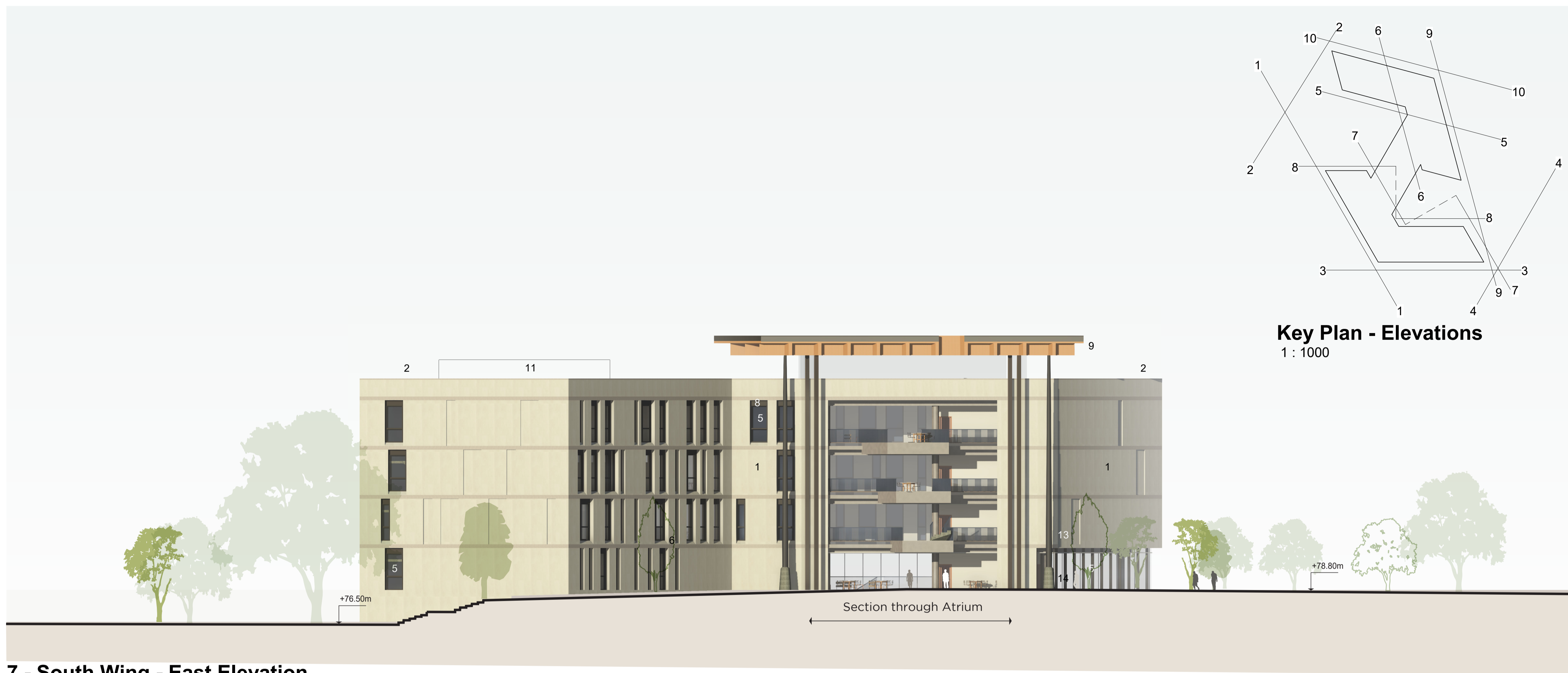
7 - South Wing - East Elevation 1 : 200