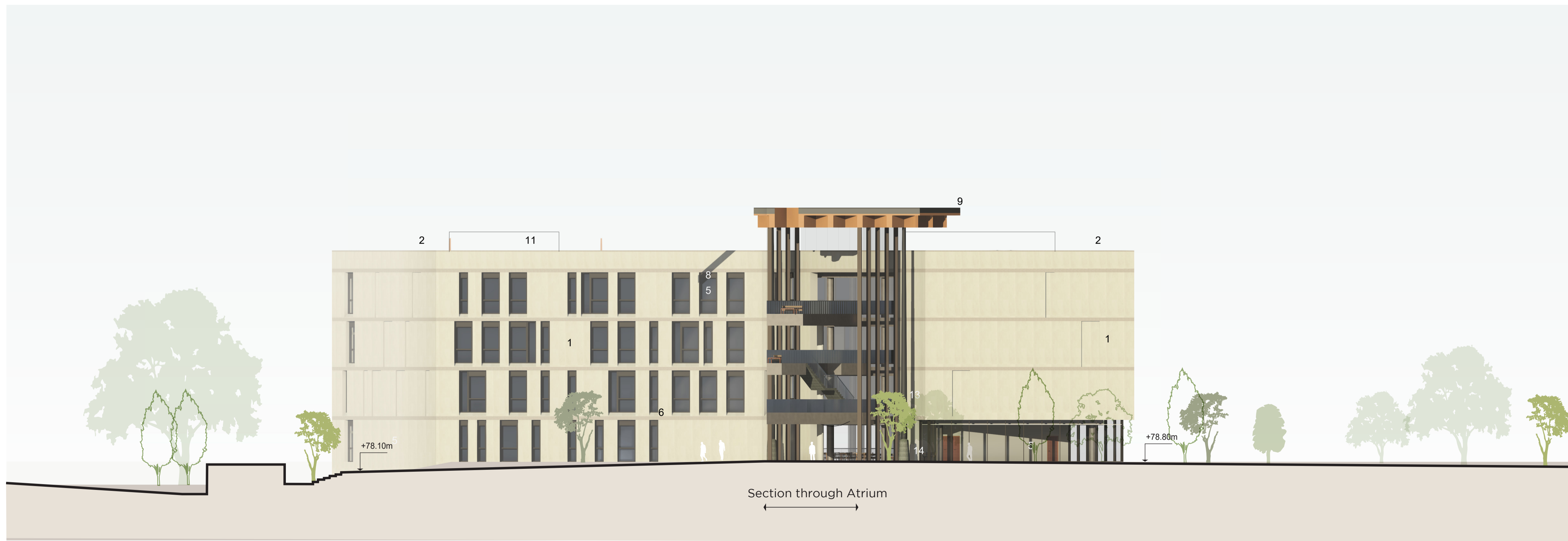
8 - South Wing - North Elevation 1 : 200