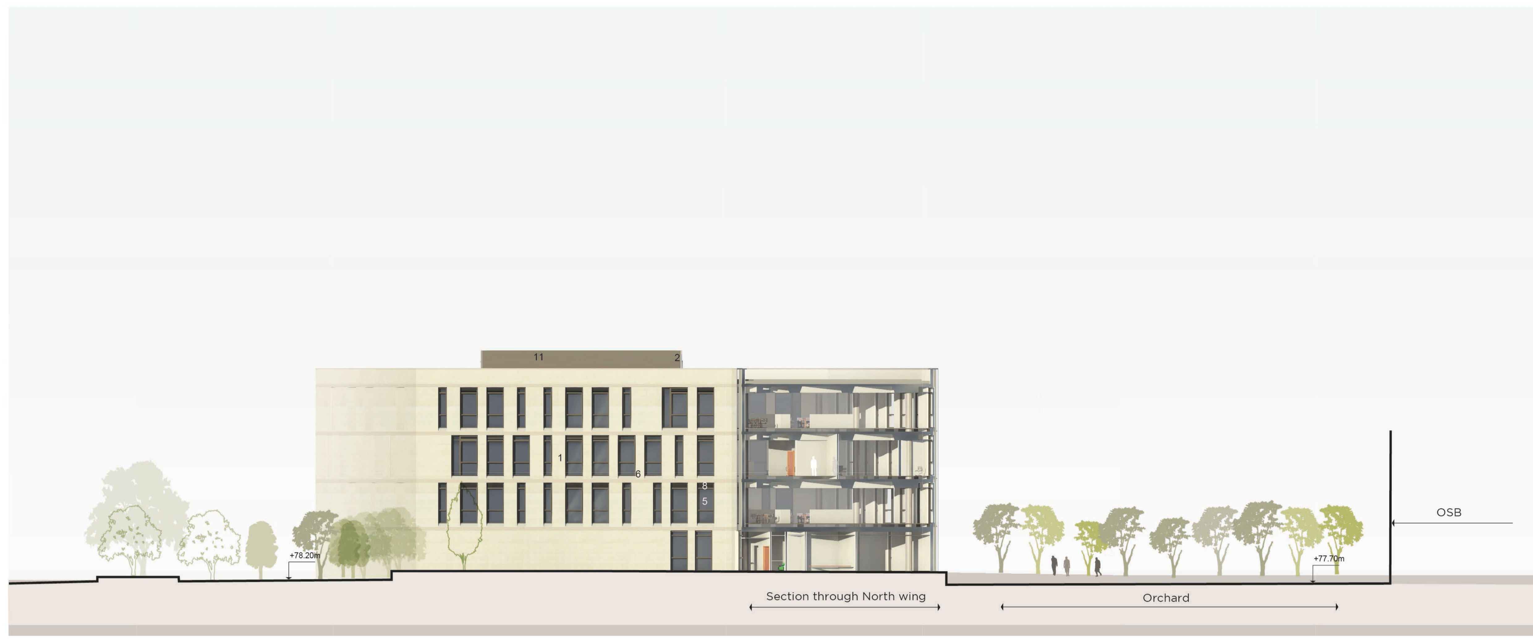
5 - North Wing - South-west Elevation 1 : 200