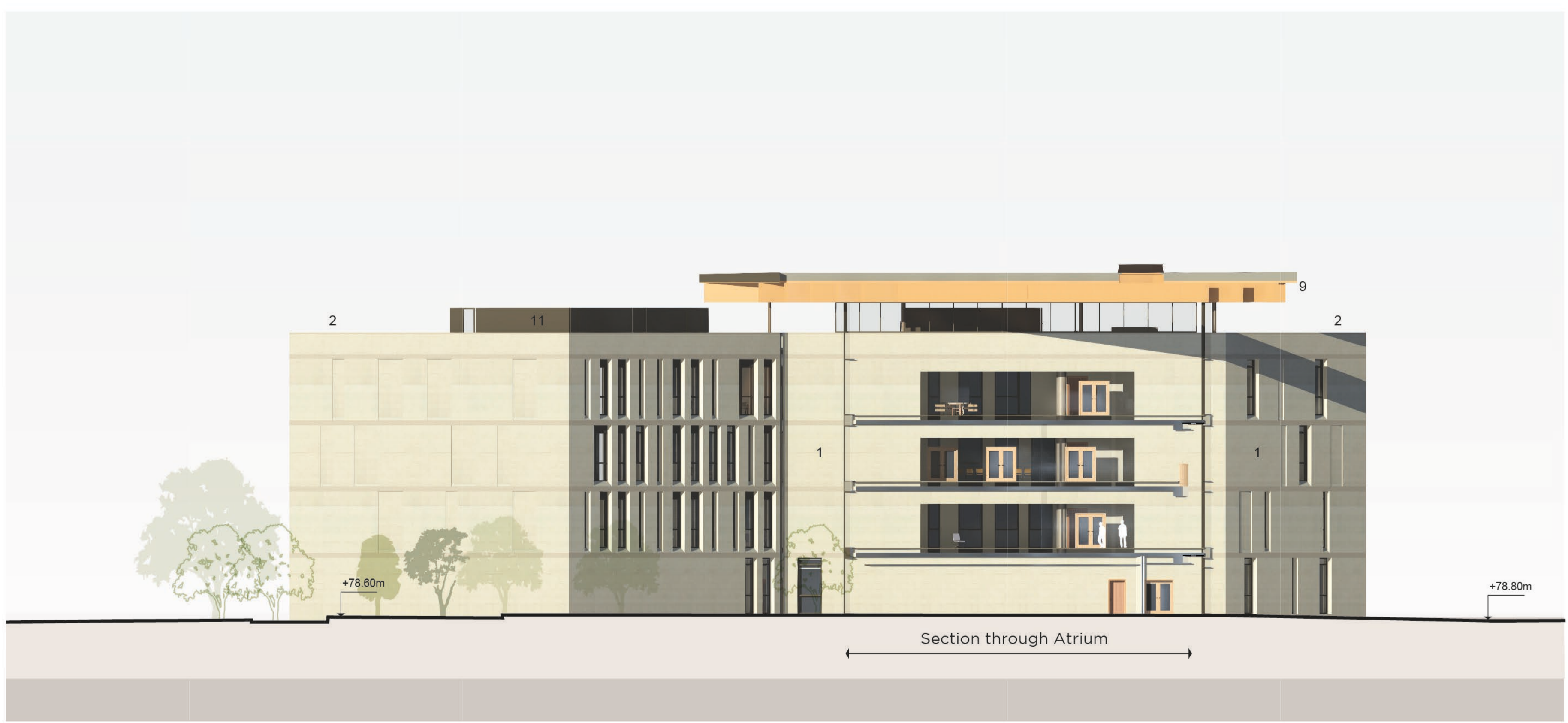
6 - North Wing - West Elevation 1 : 200