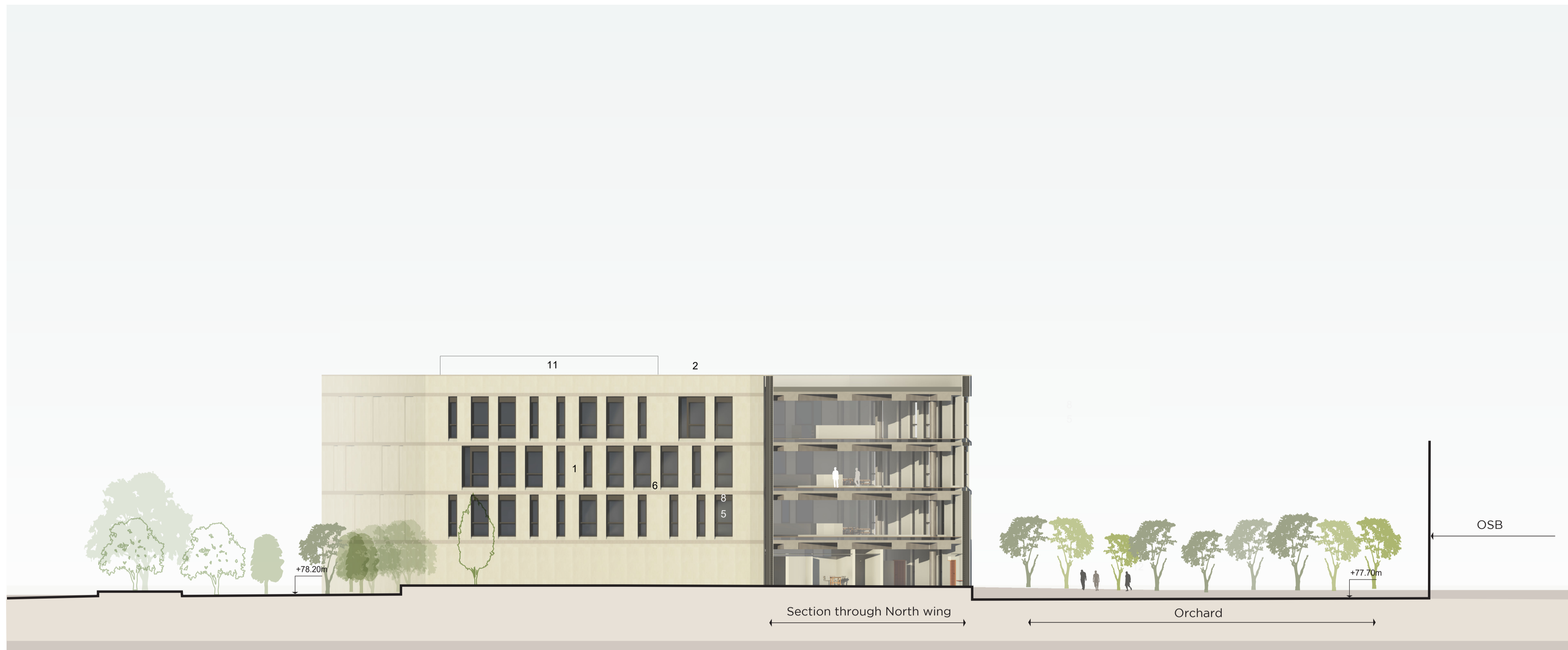
5 - North Wing - South-west Elevation 1 : 200