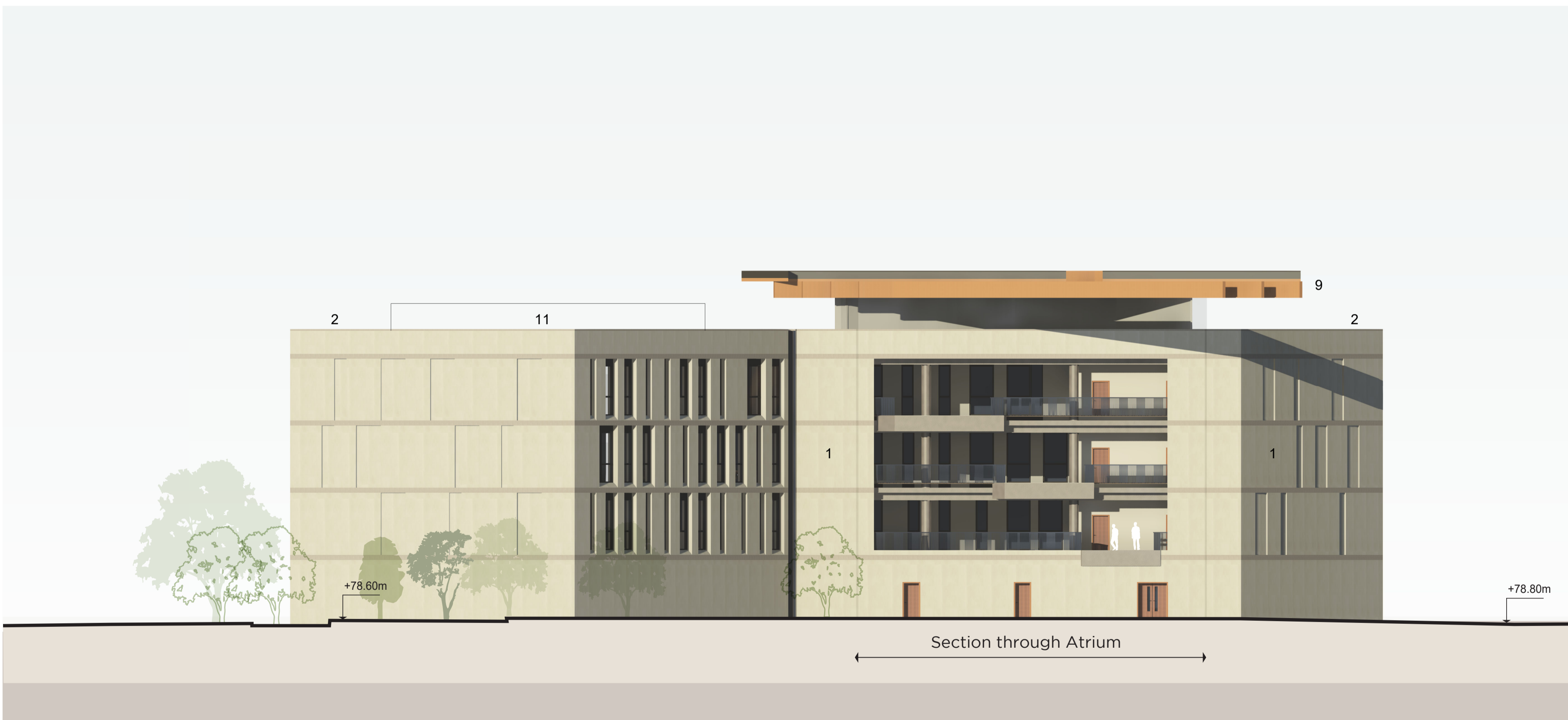
6 - North Wing - West Elevation 1 : 200