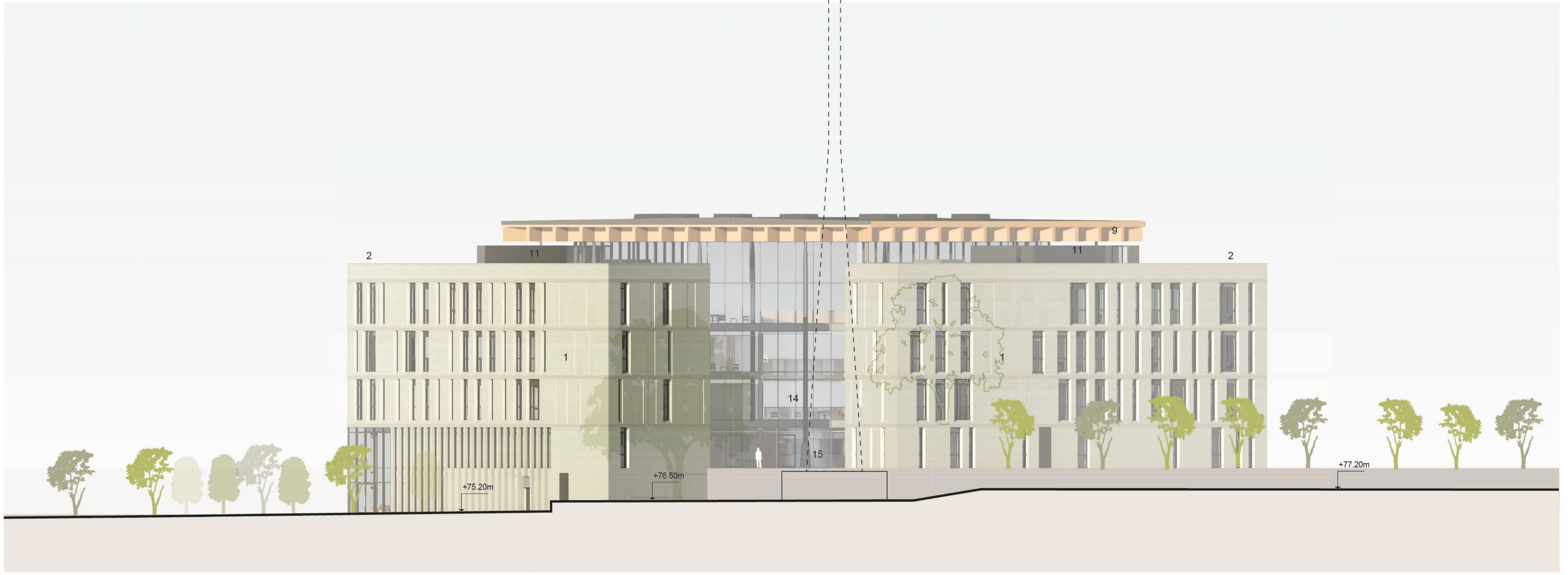
4 - South-east Elevation - Staff approach 1 : 200