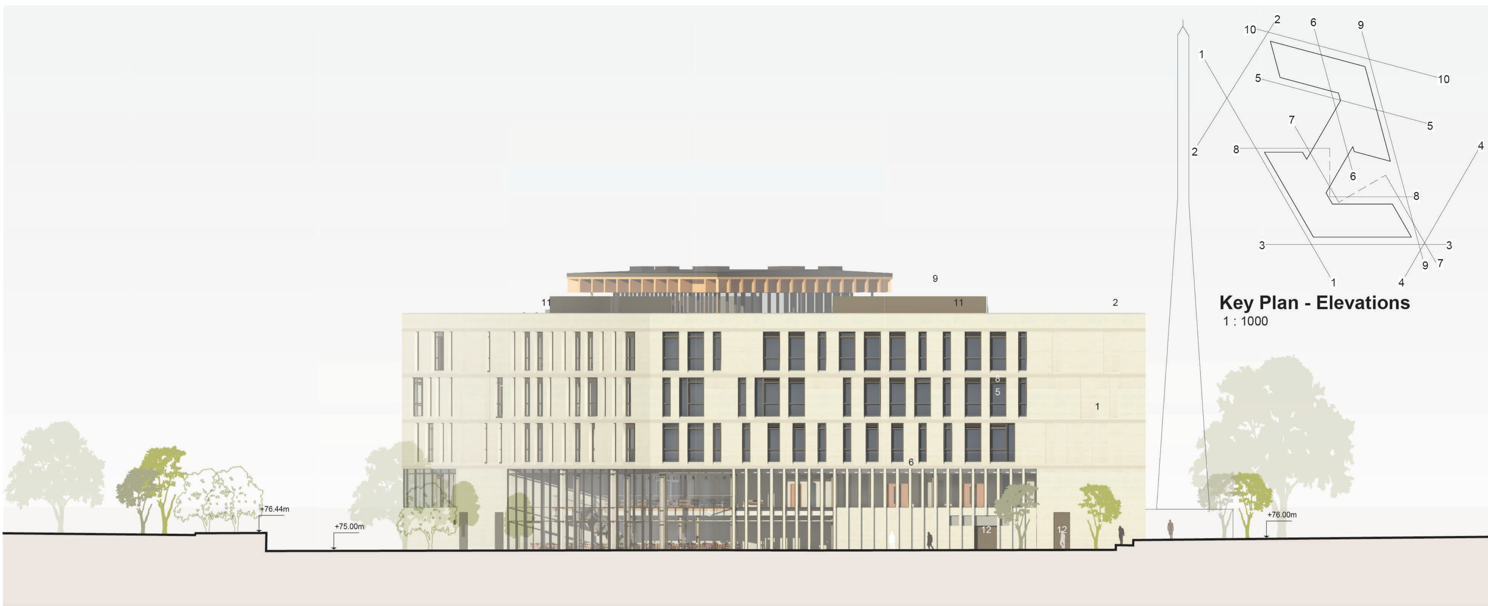
3 - South Wing - South Elevation 1 : 200