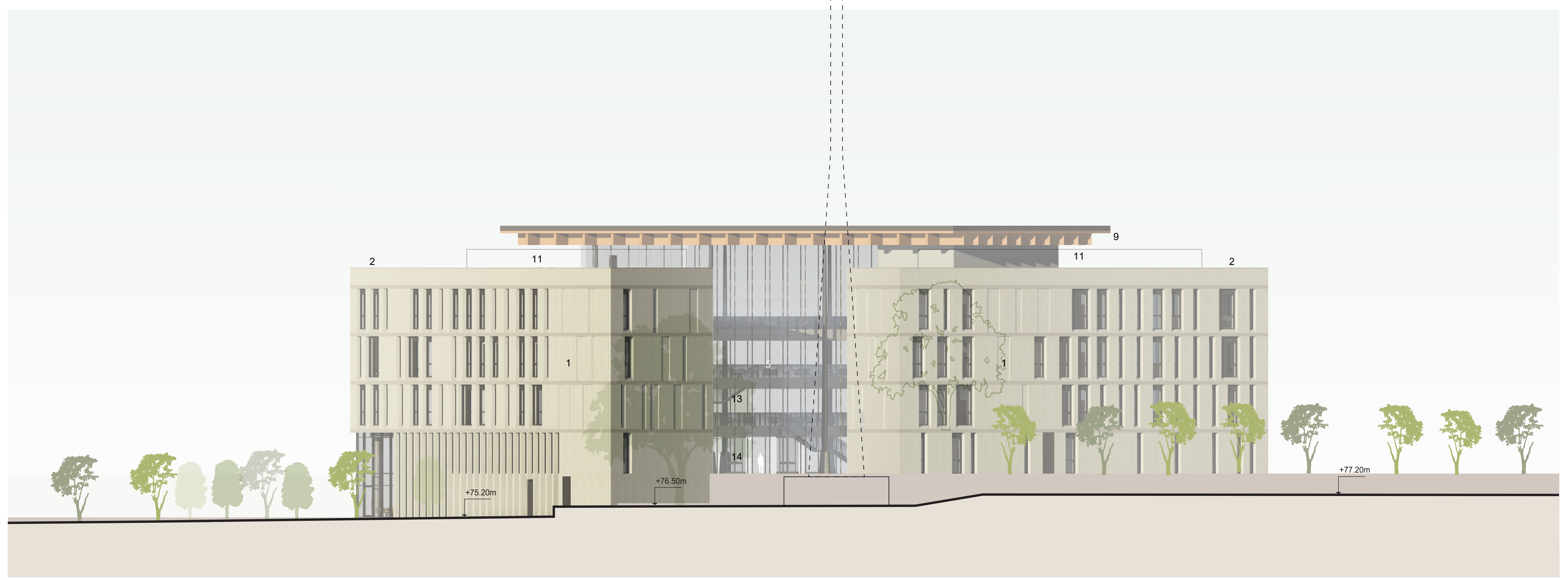
4 - South-east Elevation - Staff approach 1 : 200