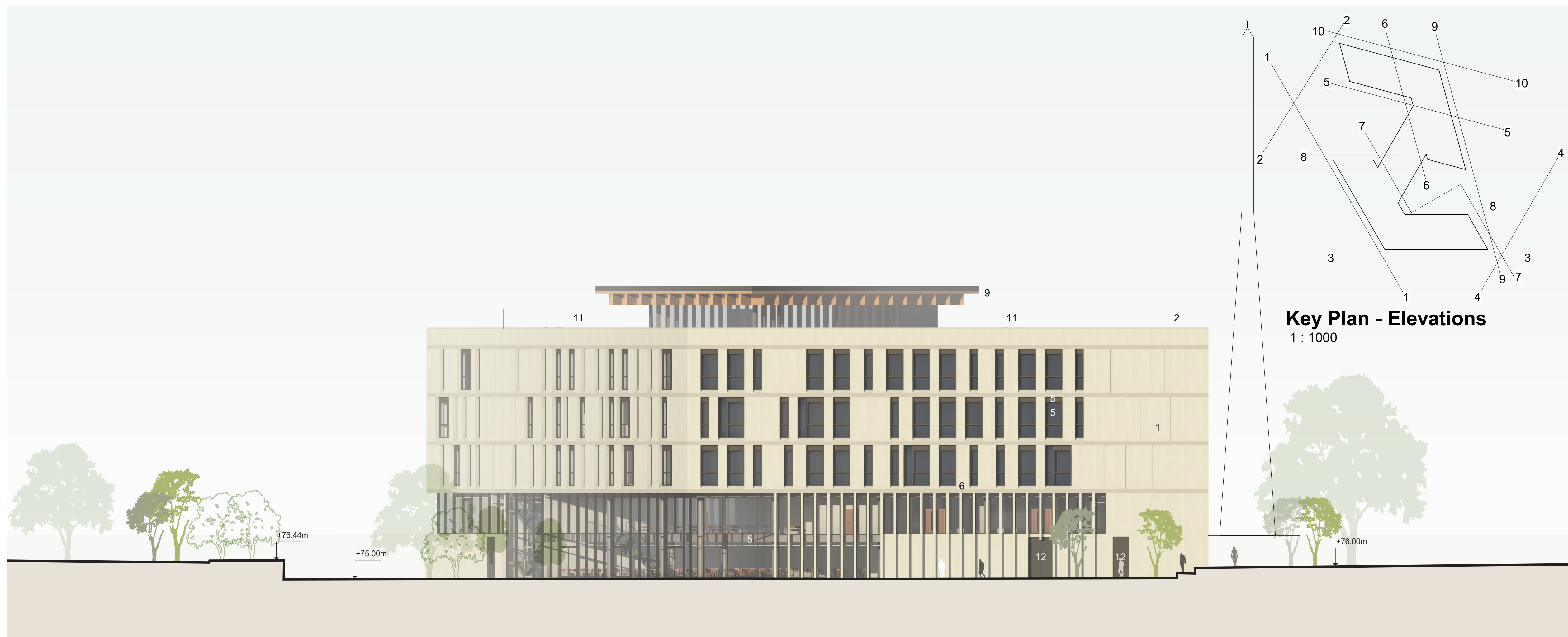
3 - South Wing - South Elevation 1 : 200