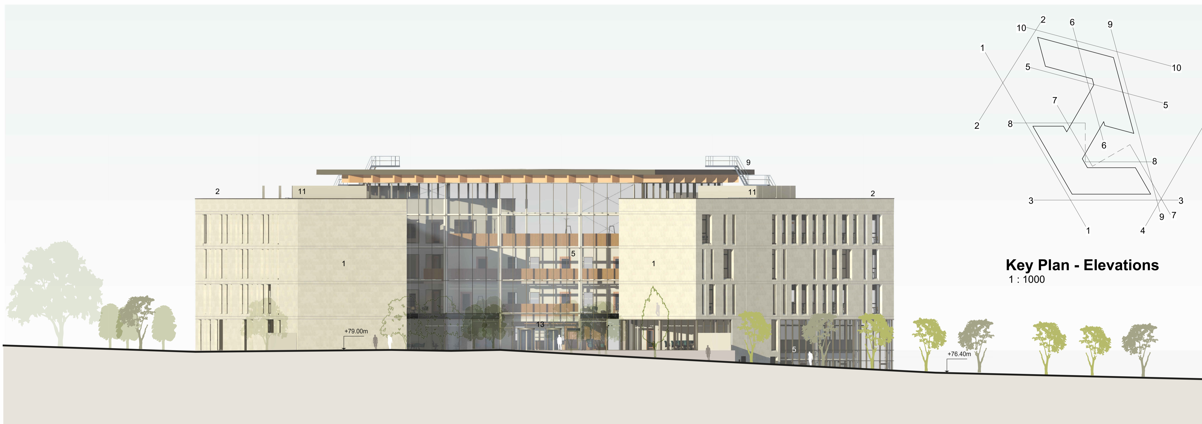
2 - North-west Elevation - Public approach