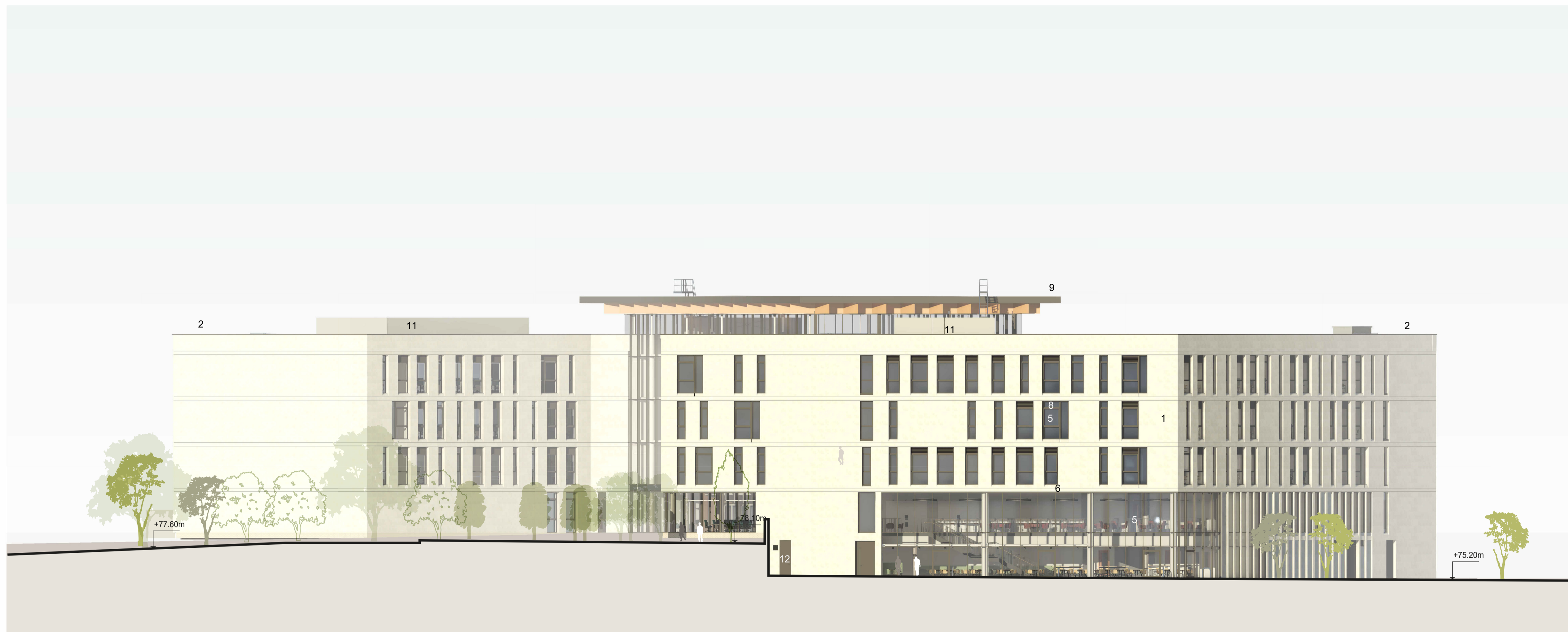
1- South Wing - West Elevation