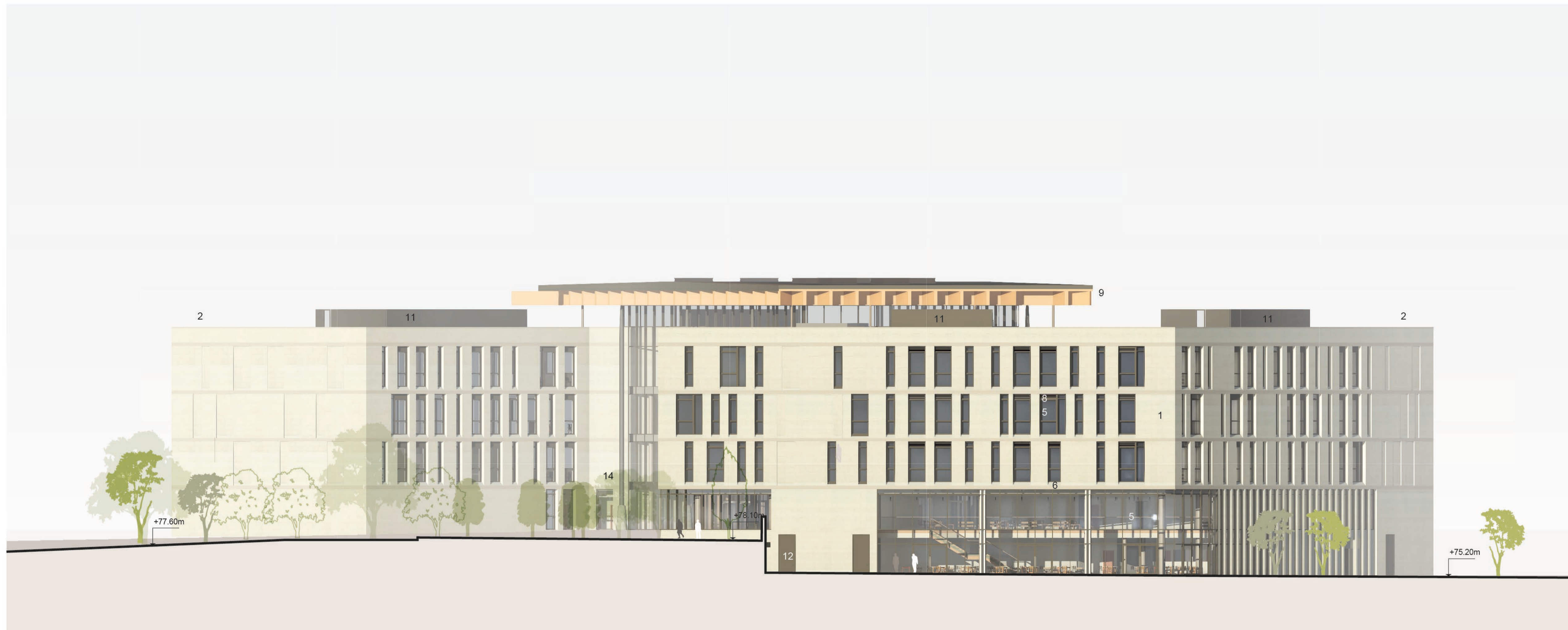
1- South Wing - West Elevation 1 : 200