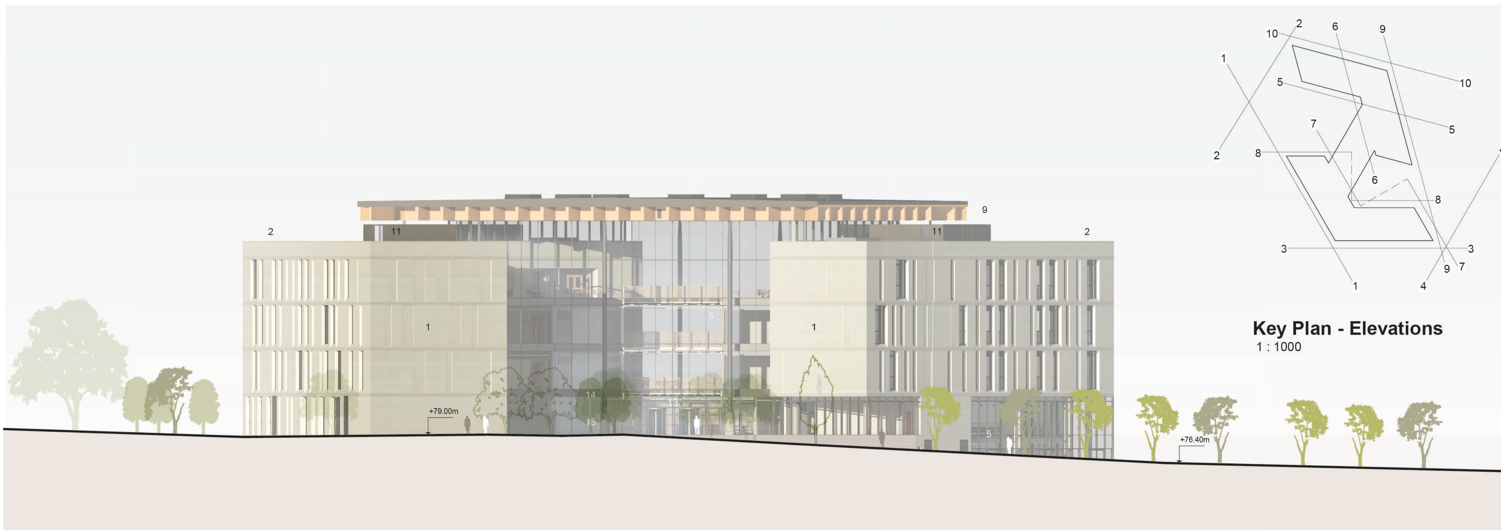
2 - North-west Elevation - Public approach 1 : 200