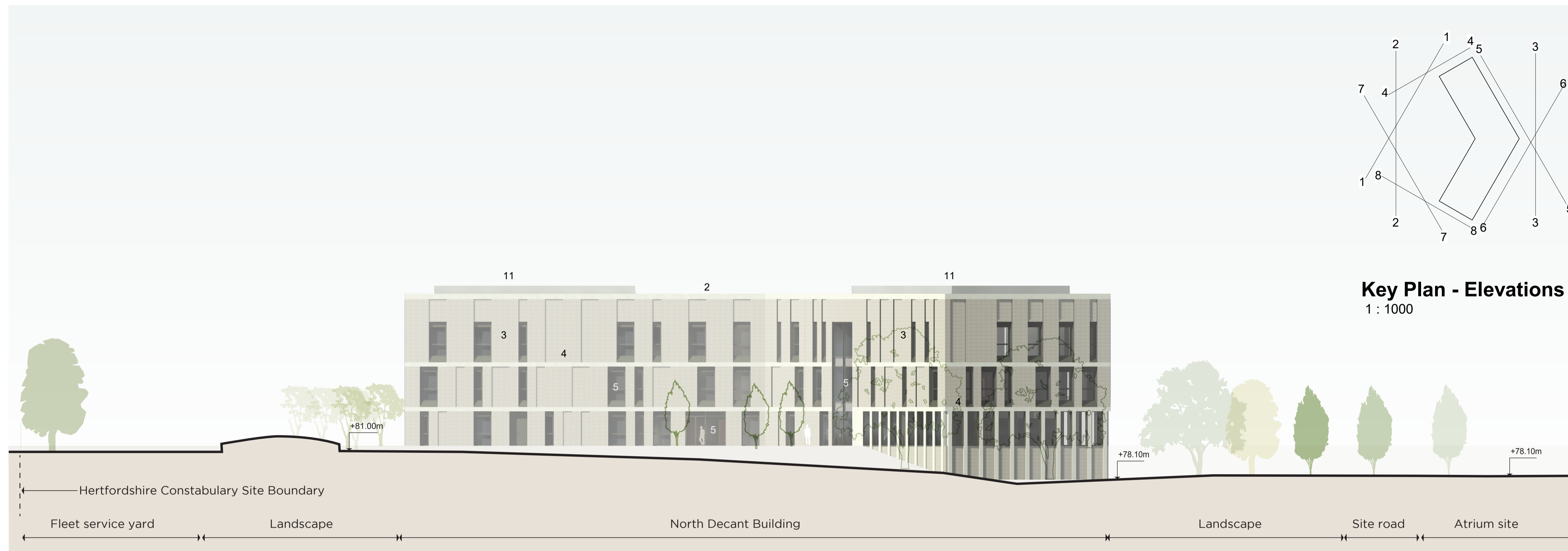
7 - West Elevation 1 : 200