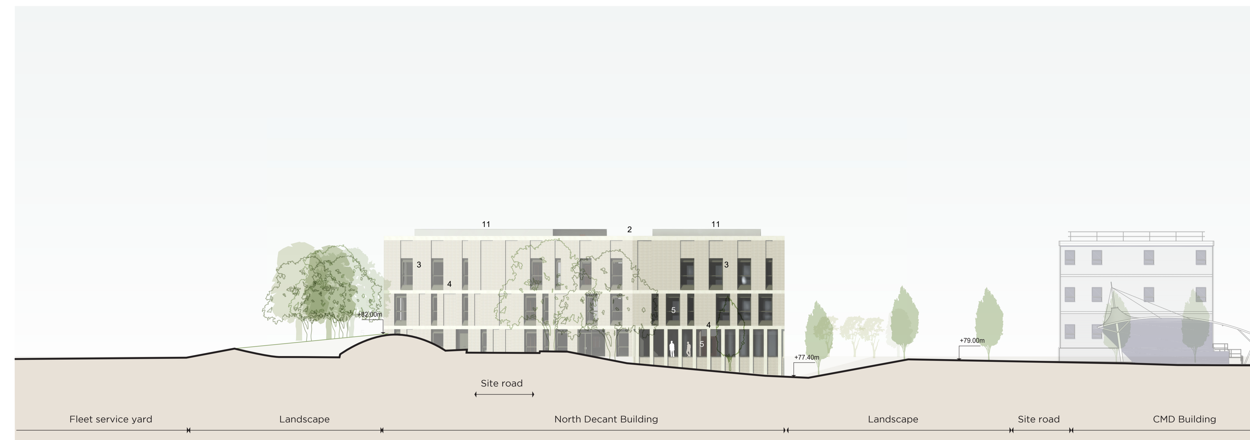
8 - South-west Elevation 1 : 200