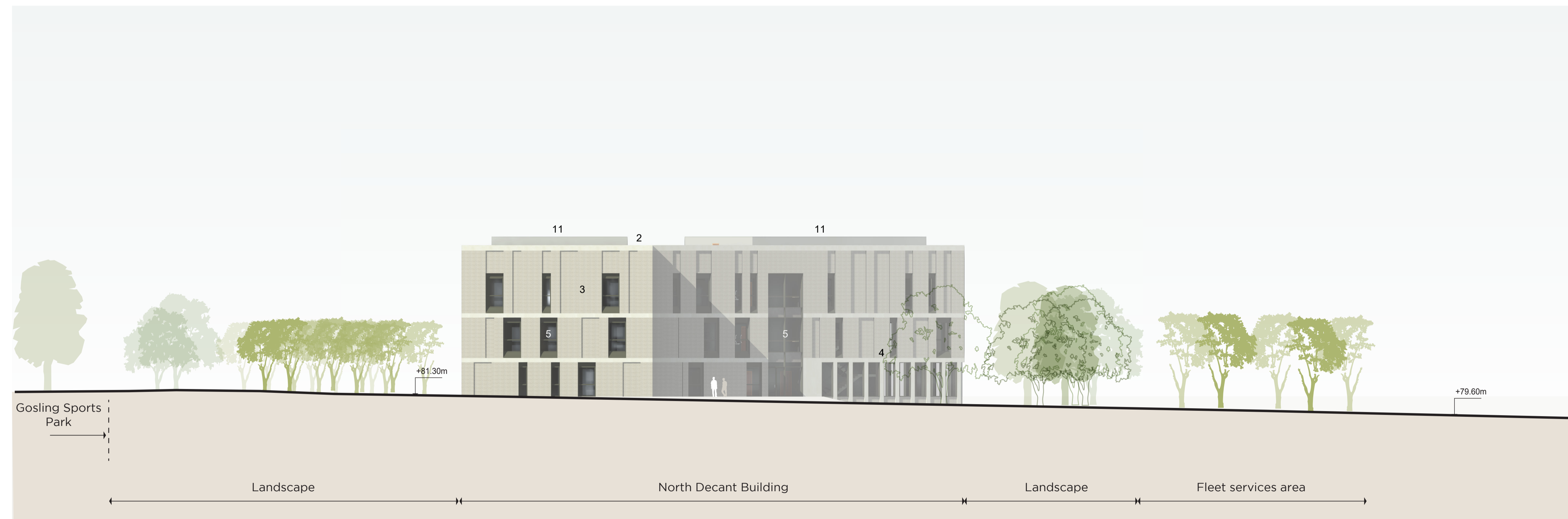
4 - North Elevation 1 : 200