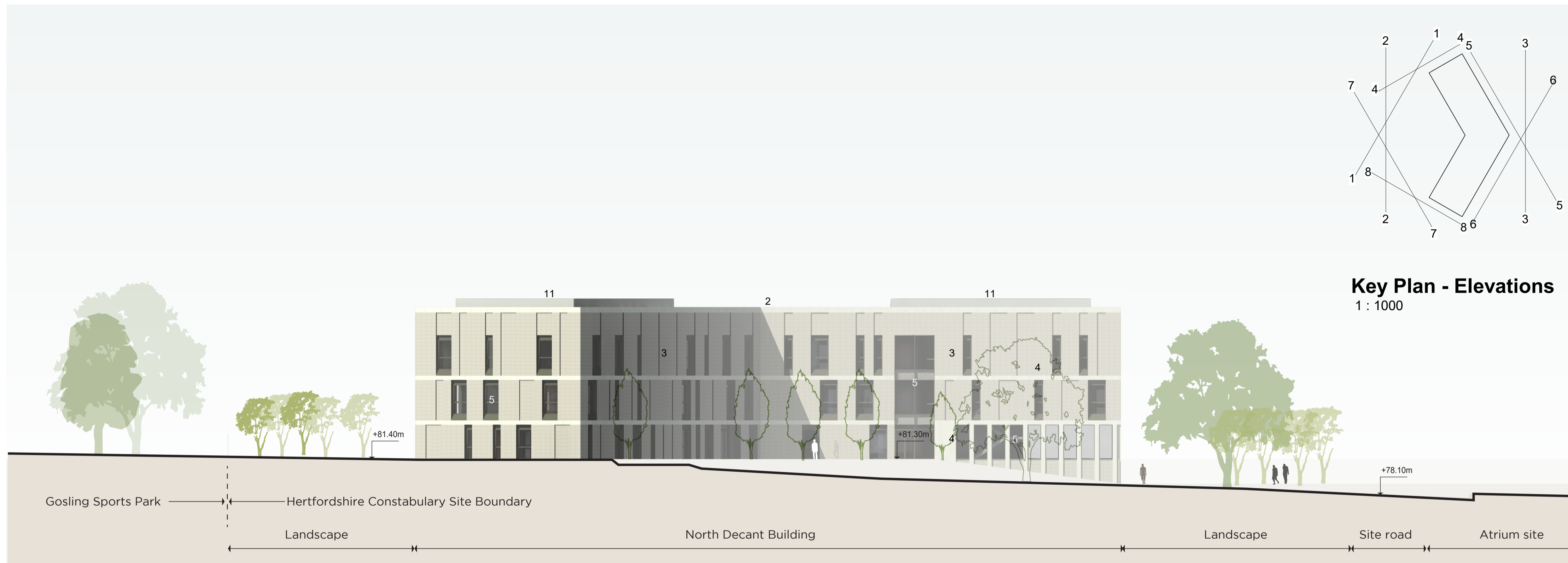
1 - West Elevation - View 1 1 : 200