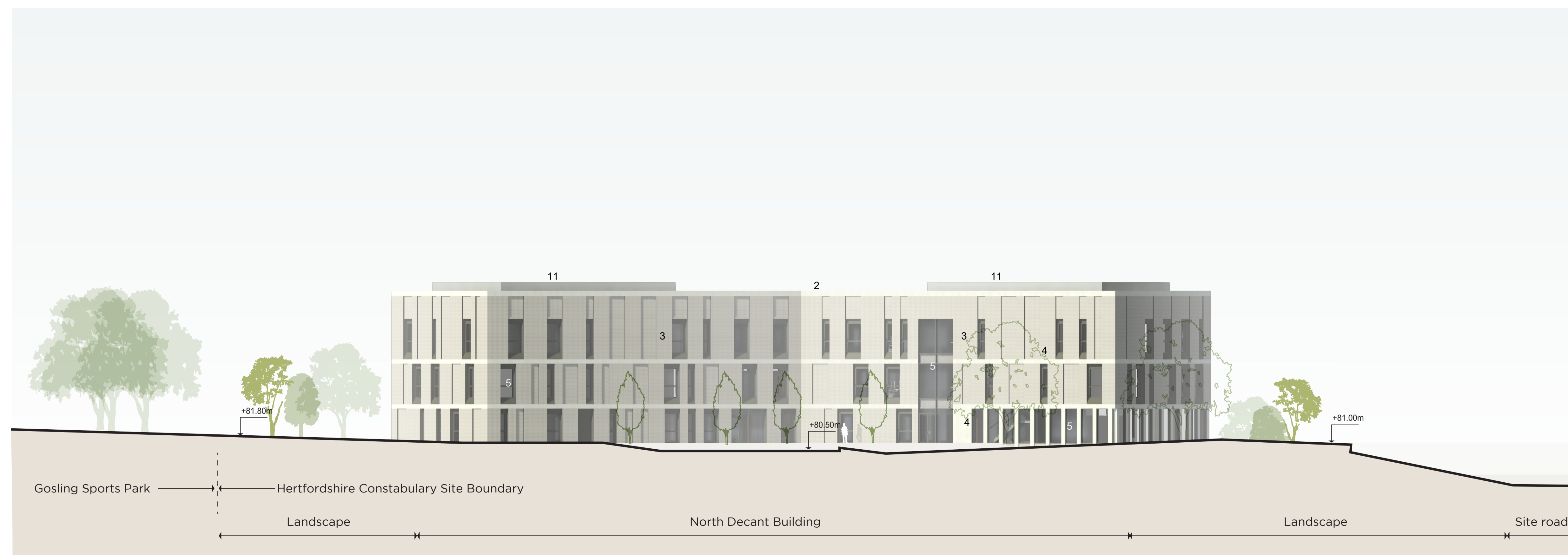
2 - West Elevation - View 2 1 : 200