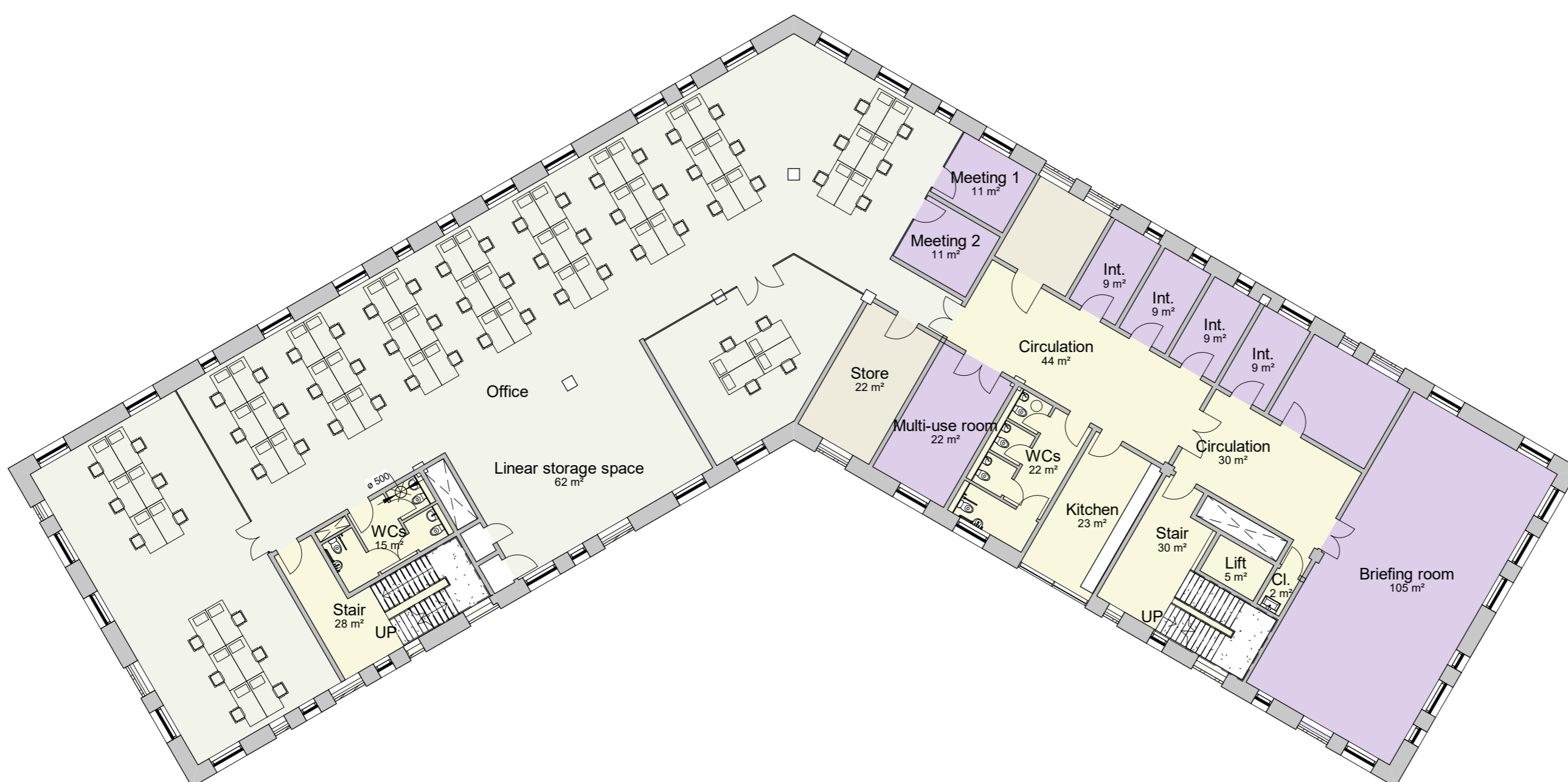
First Floor Plan 1 : 200