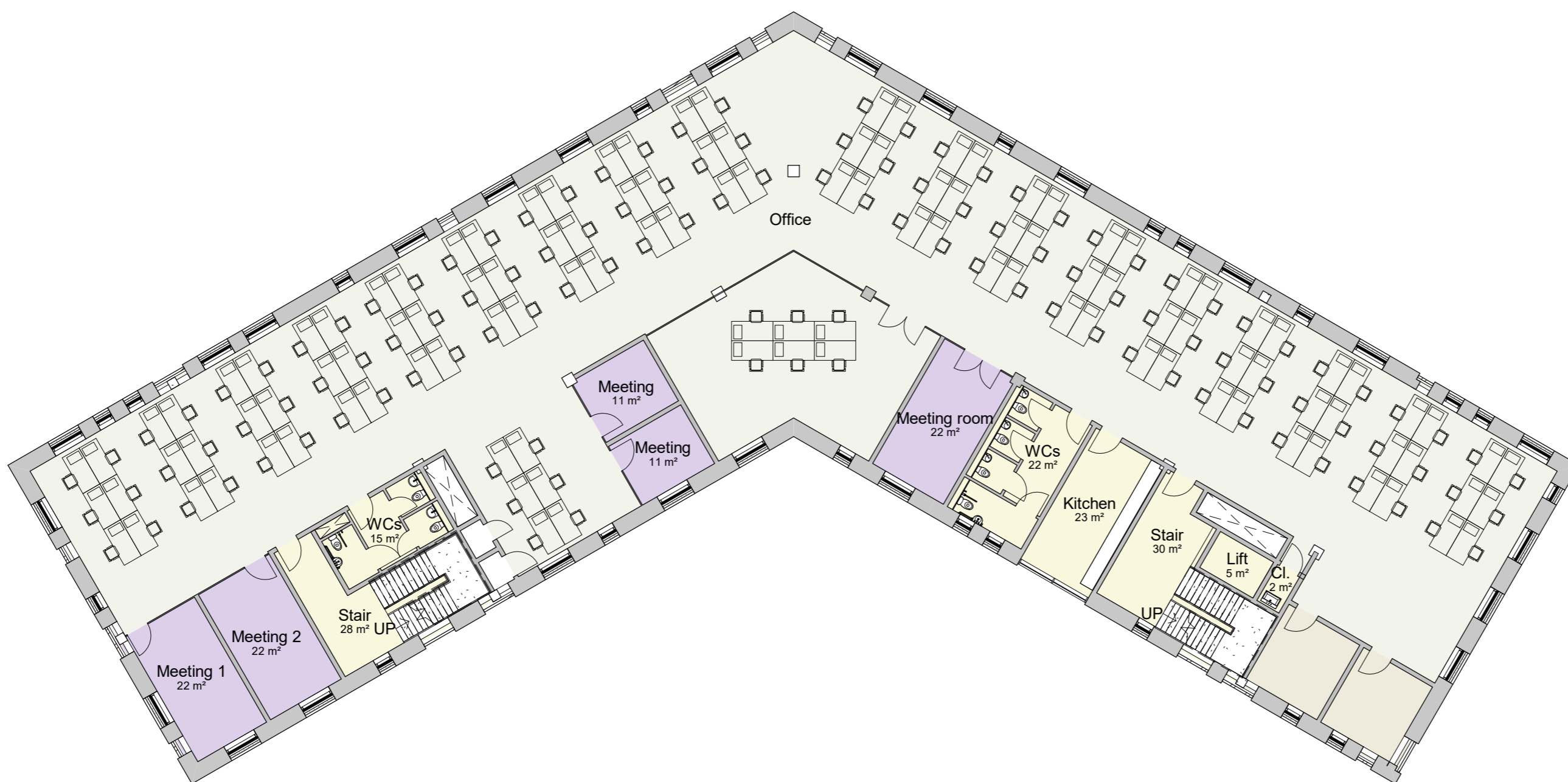
Second Floor Plan 1 : 200