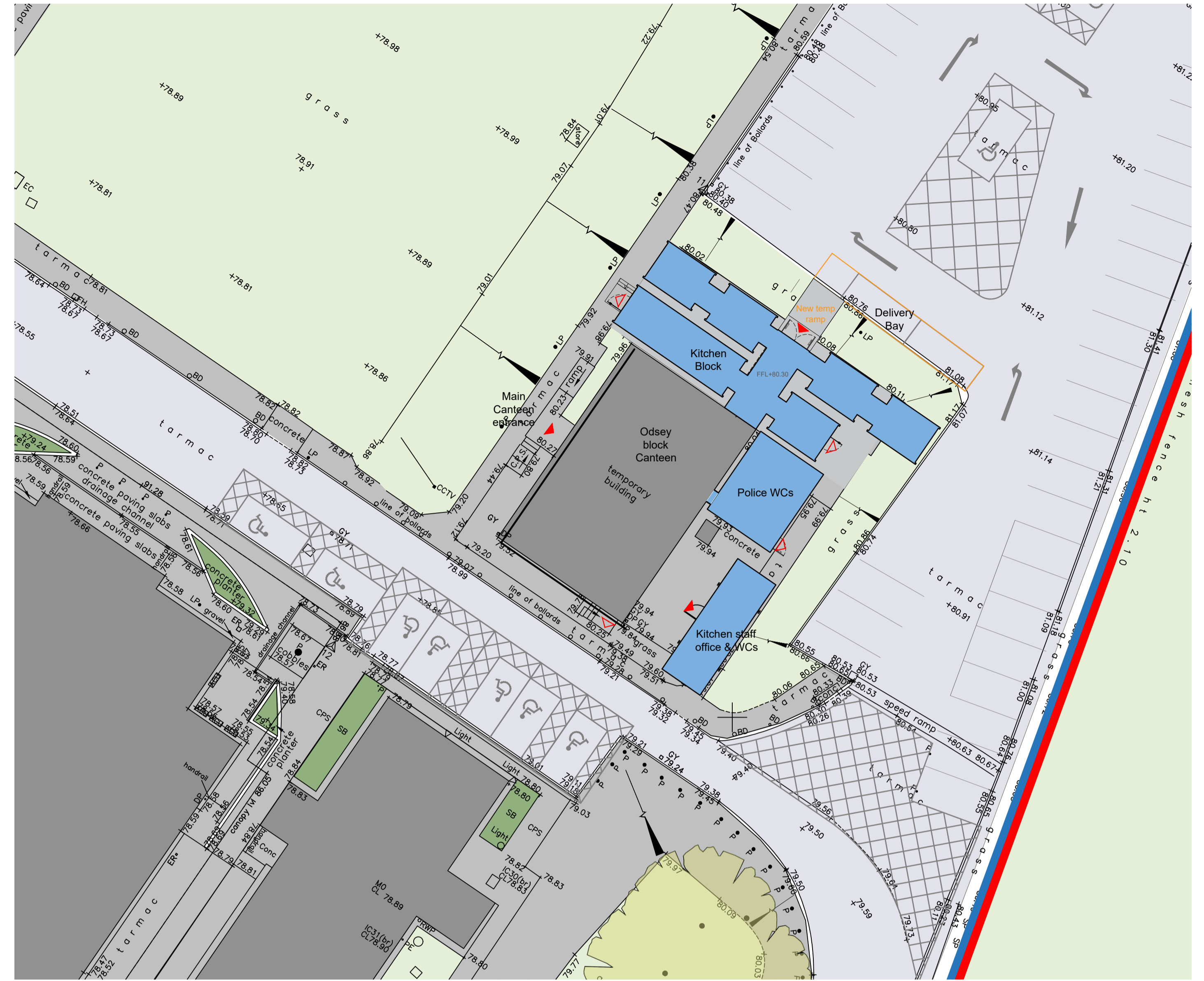
Extract of Proposed Site Plan