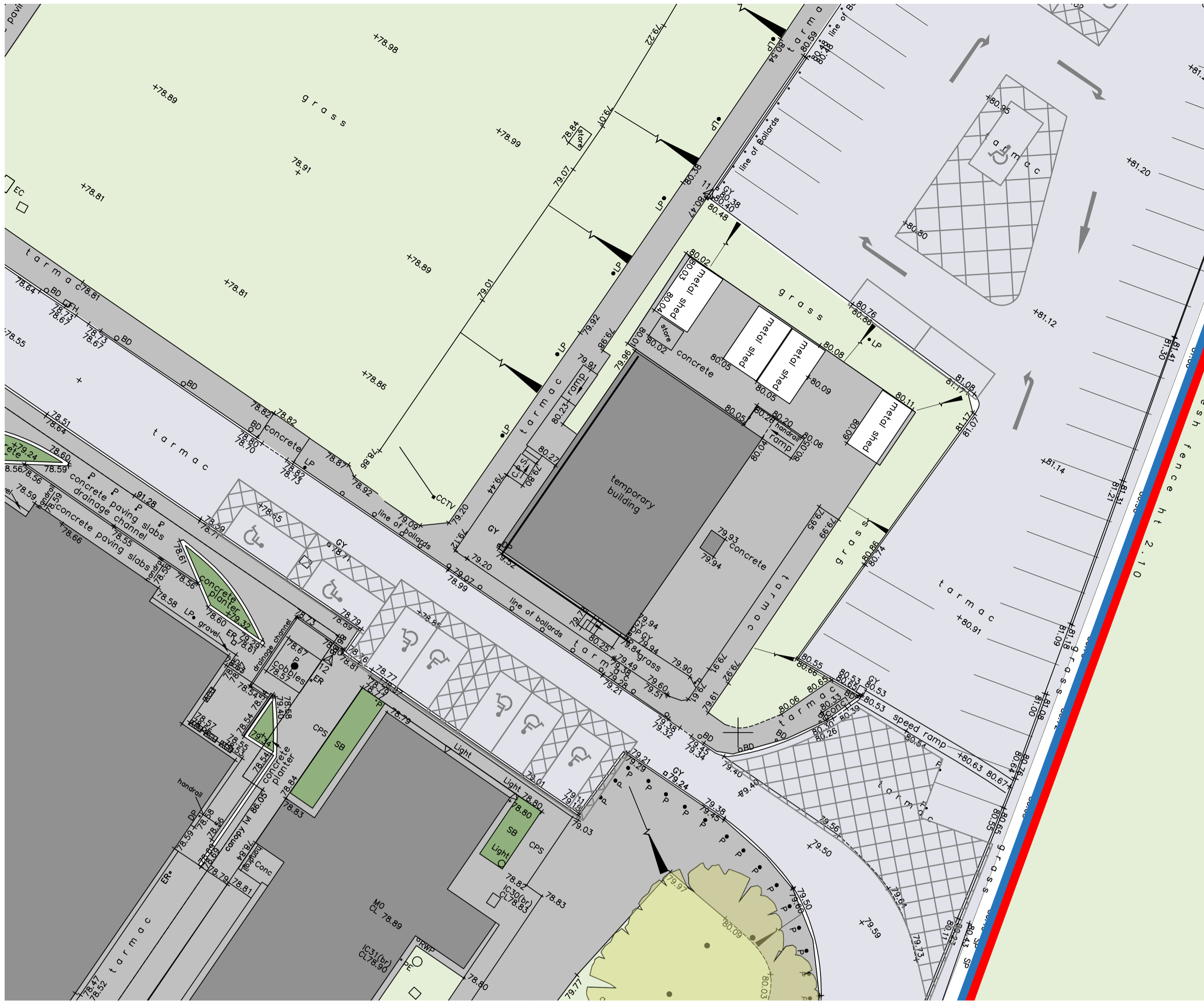
Extract of Existing Site Plan