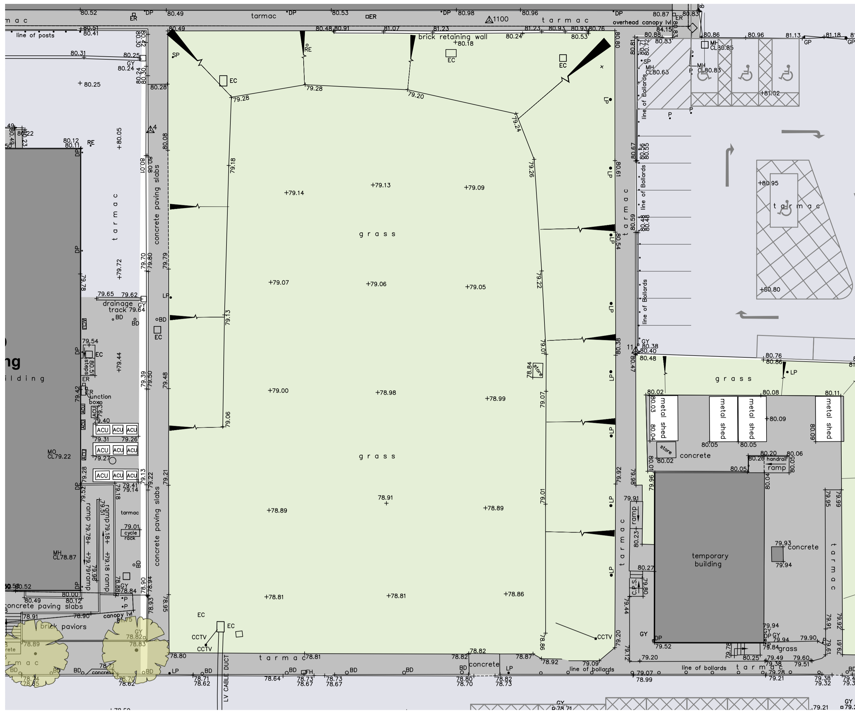
Extract of Existing Site Plan