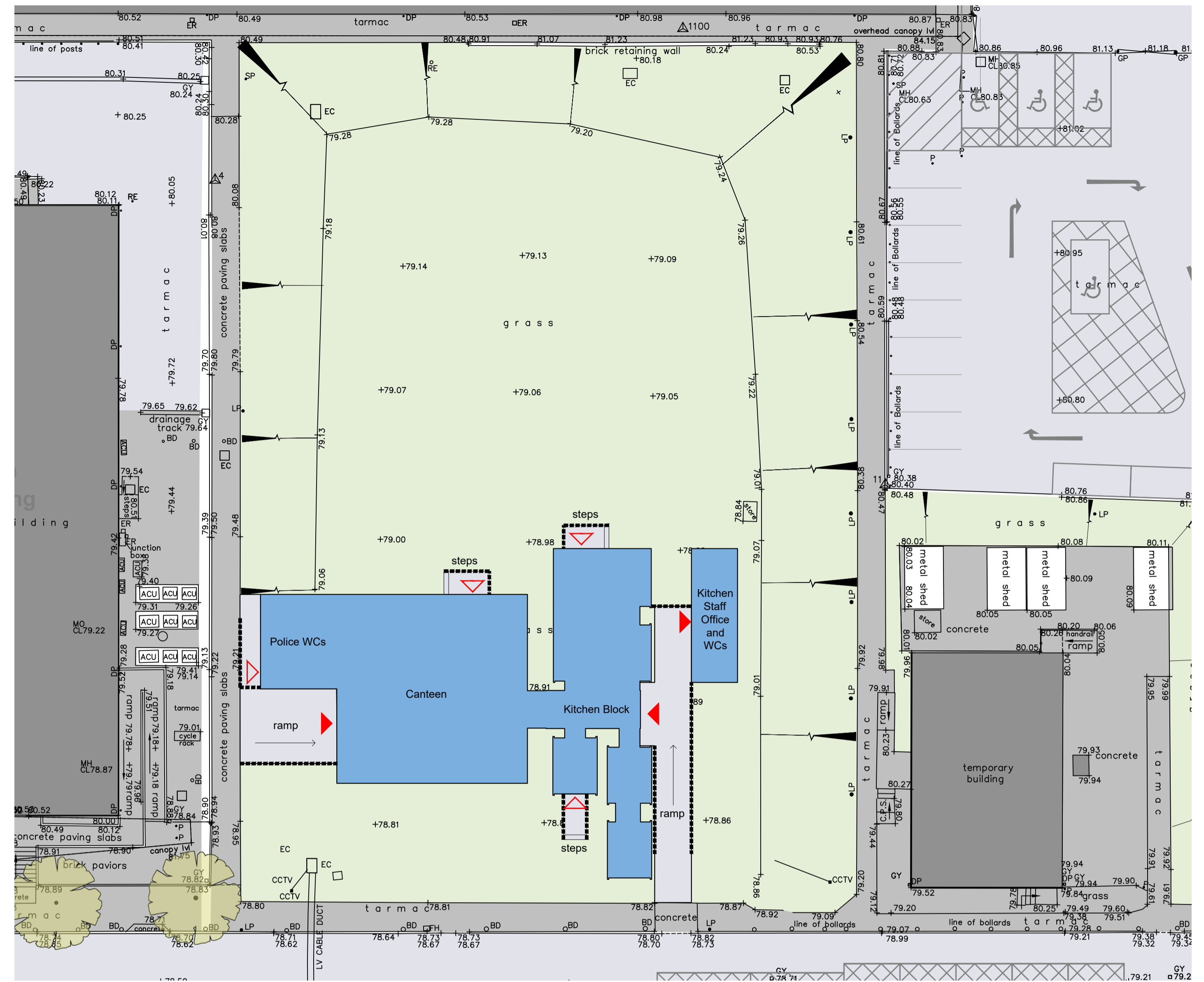
Extract of Proposed Site Plan