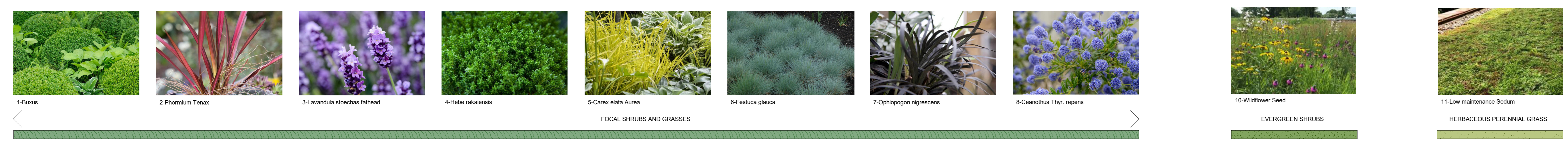
FOCAL SHRUBS AND GRASSES