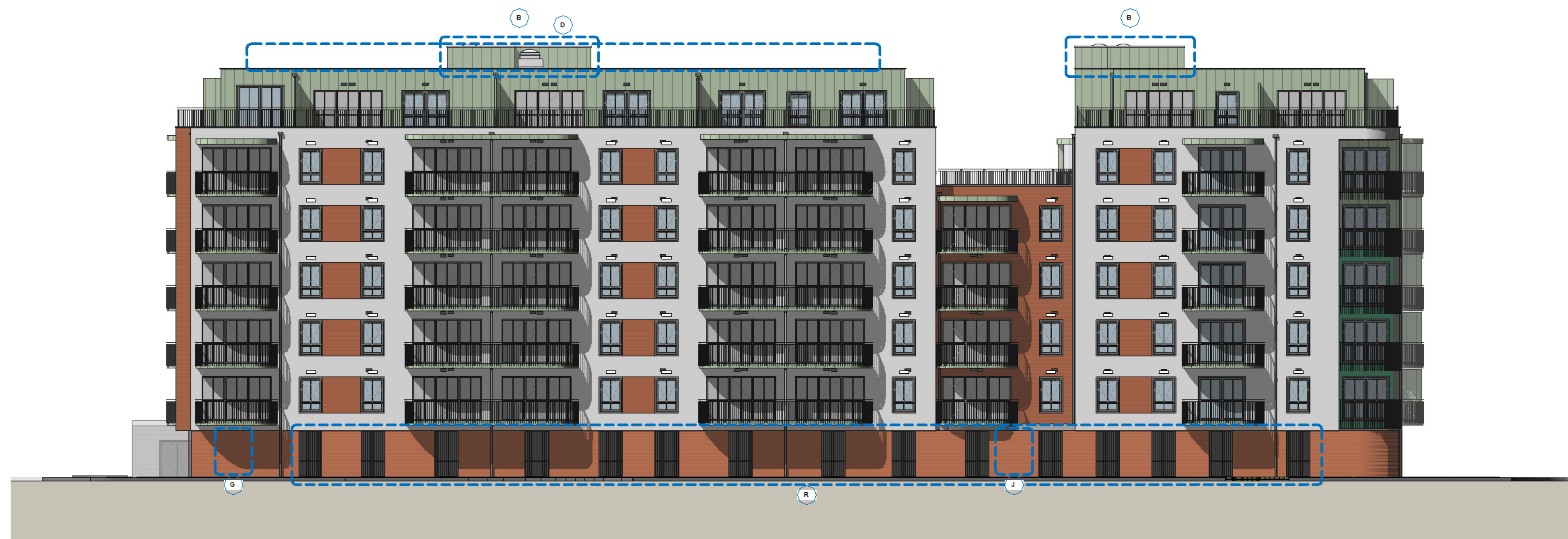
7. SOUTHWEST TRUE ELEVATION (JETLINER WAY) 1 : 100