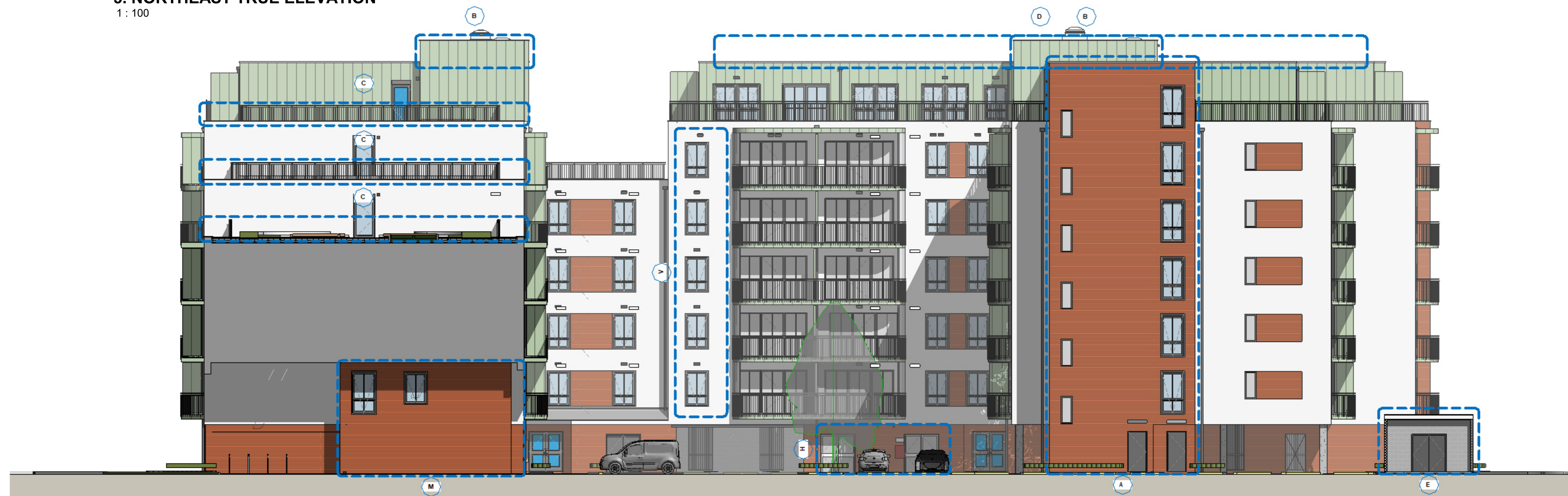
6. NORTHEAST SECTIONAL ELEVATION 1 : 100

Legend: X Non-Material Amendments Cabinet defines portions of the building in plan and elevation that have necessary amendments from the original approved drawings.