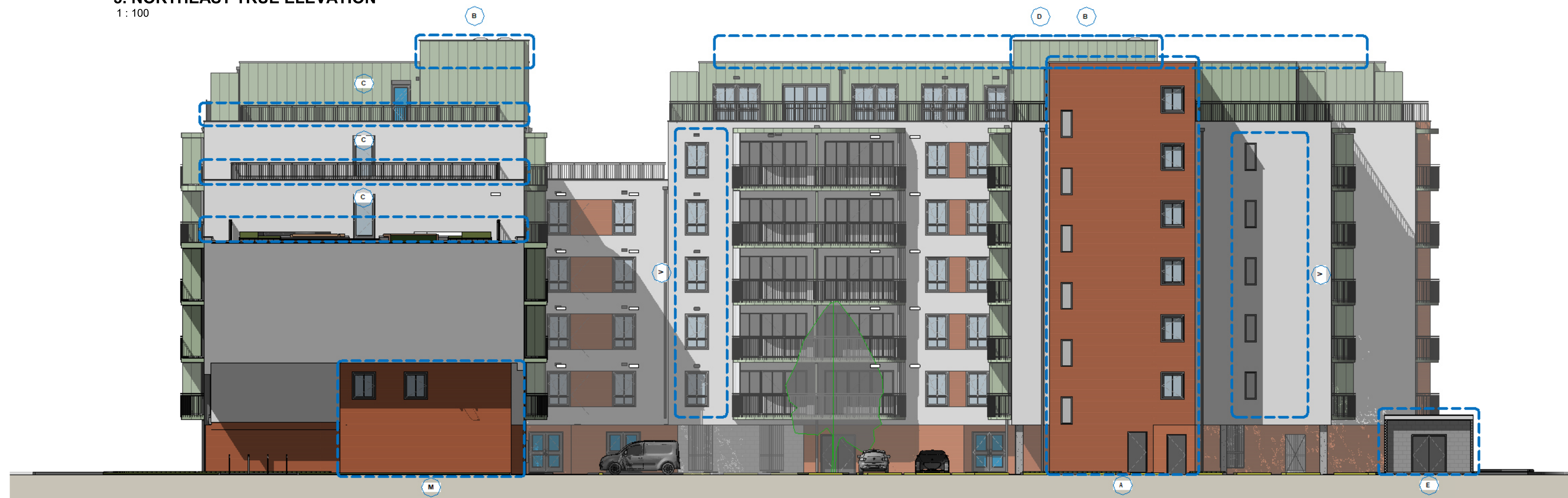
6. NORTHEAST SECTIONAL ELEVATION 1 : 100

Legend: X Non-Material Amendments Cabinet defines portions of the building in plan and elevation that have necessary amendments from the original approved drawings.