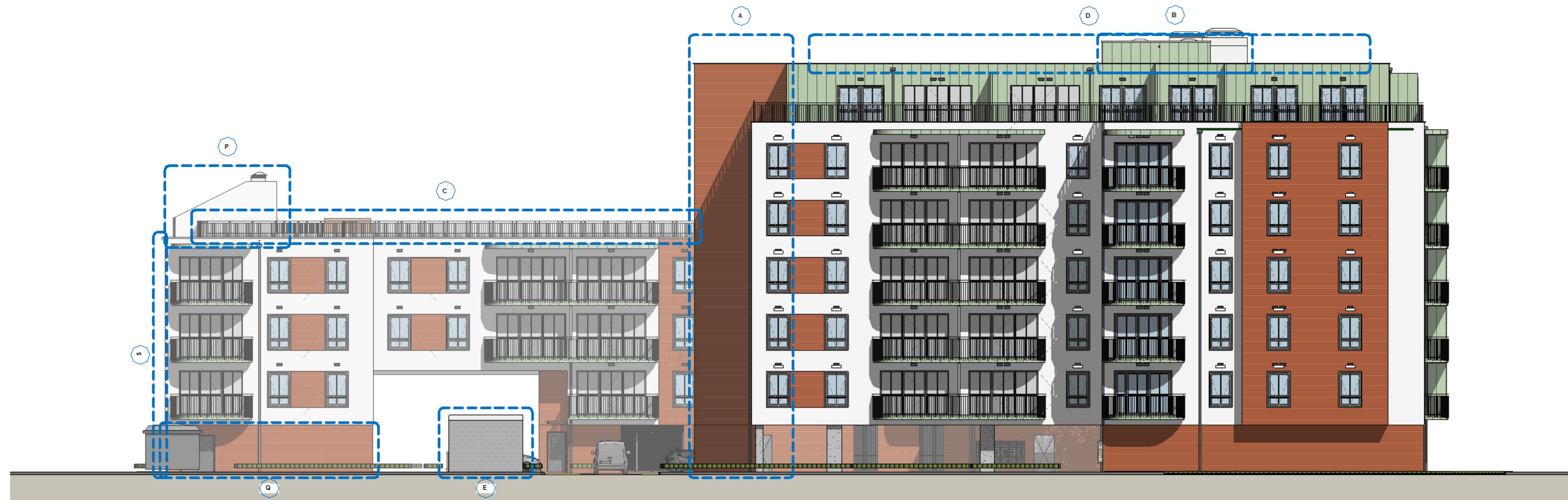
3. NORTHWEST TRUE ELEVATION (GOLDSMITH WAY) 1 : 100