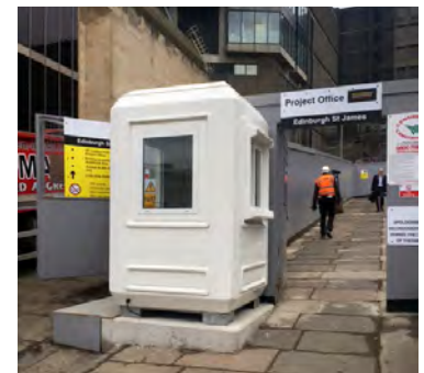
Genesis Kiosk 1.5 x 1.5 Model