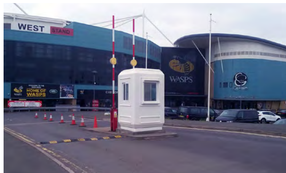
Genesis Kiosk 1.5 x 1.5 Model