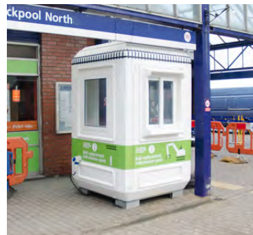
Genesis Kiosk 1.5 x 1.5 Model