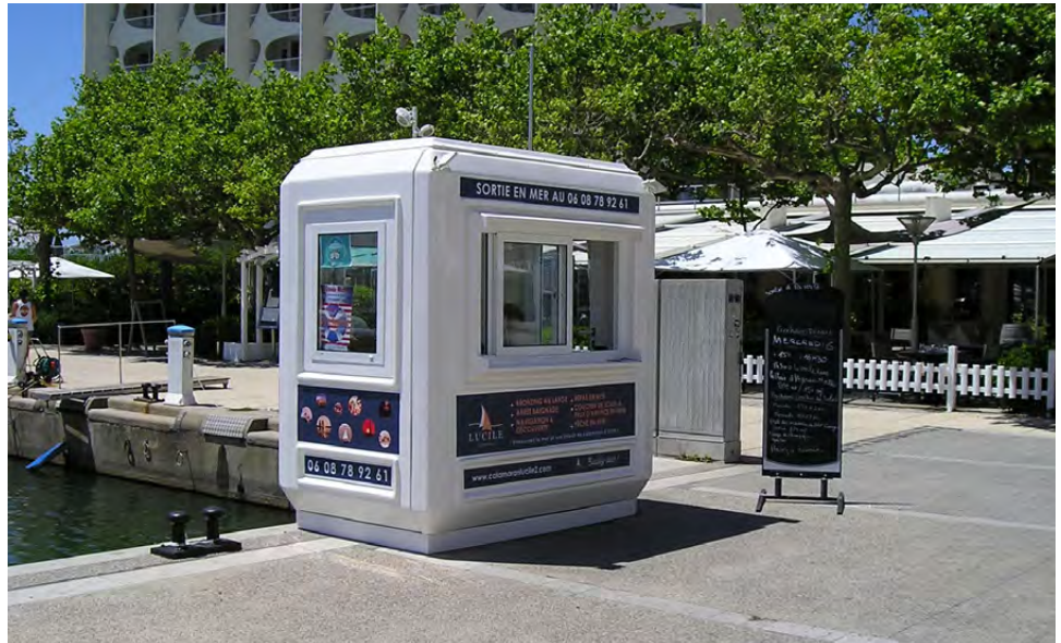
Genesis Kiosk 2.3 x 1.5 Model

*NOTE: For 1.5 x 1.5m and 2.3 x 1.5m Models a forklift truck with 1200mm long forks (minimum) is required for customer off-loading. If you do not have access to a forklift truck, then please advise us at your time of order, so that we can arrange delivery using a crane-equipped vehicle for a small nominal charge. The 2.7 x 2.2m Model will always be delivered using a crane-equipped vehicle, again for a small nominal charge, based on a mainland UK delivery location.