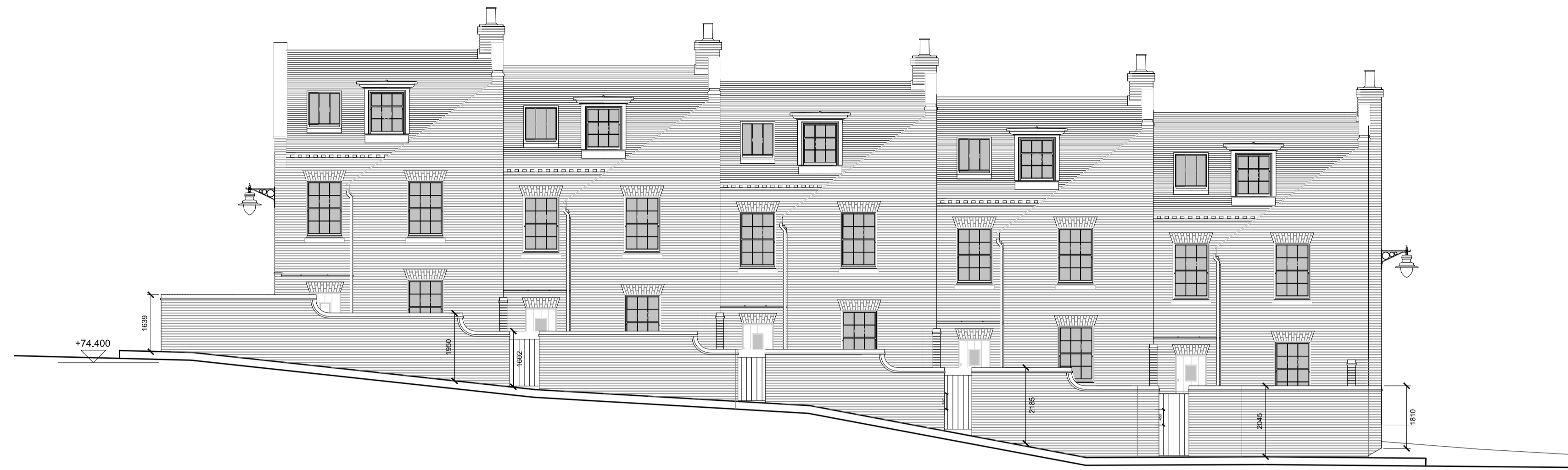
1 Rear Elevation - South Scale: 1:50

USE FIGURED DIMENSIONS ONLY ALL DIMENSIONS MUST BE CHECKED ON SITE ANY INCONSISTENCIES MUST BE REPORTED BACK TO THE ARCHITECT. THIS DRAWING AND ANY DESIGNS INDICATED THEREON ARE THE COPYRIGHT OF BROOKS / MURRAY ARCHITECTS. ALL RIGHTS ARE RESERVED. NO PART OF THIS WORK MAY BE PRODUCED WITHOUT PRIOR PERMISSION IN WRITING FROM BROOKS / MURRAY ARCHITECTS.