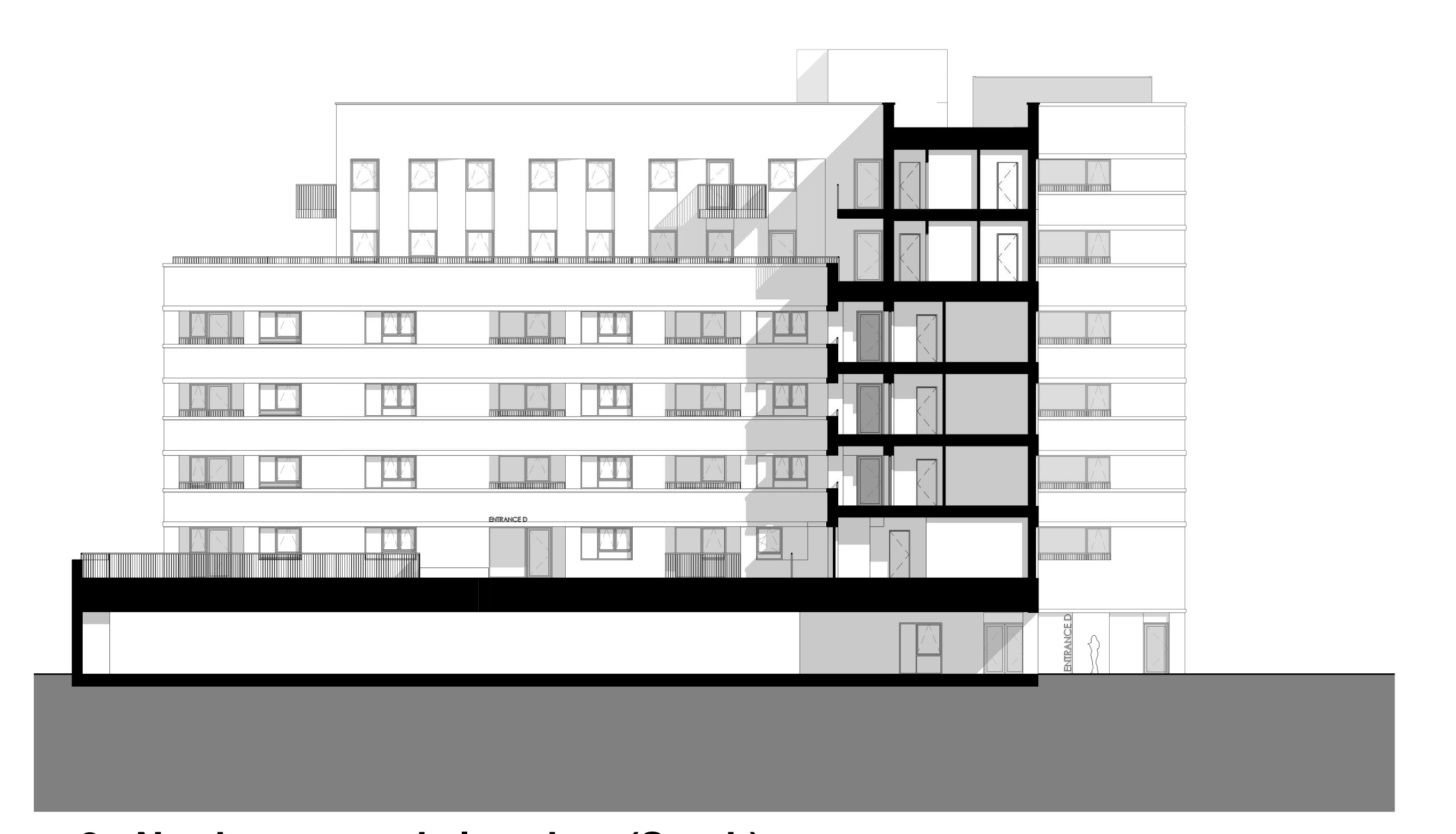
8 - North courtyard elevation (South) 1:200