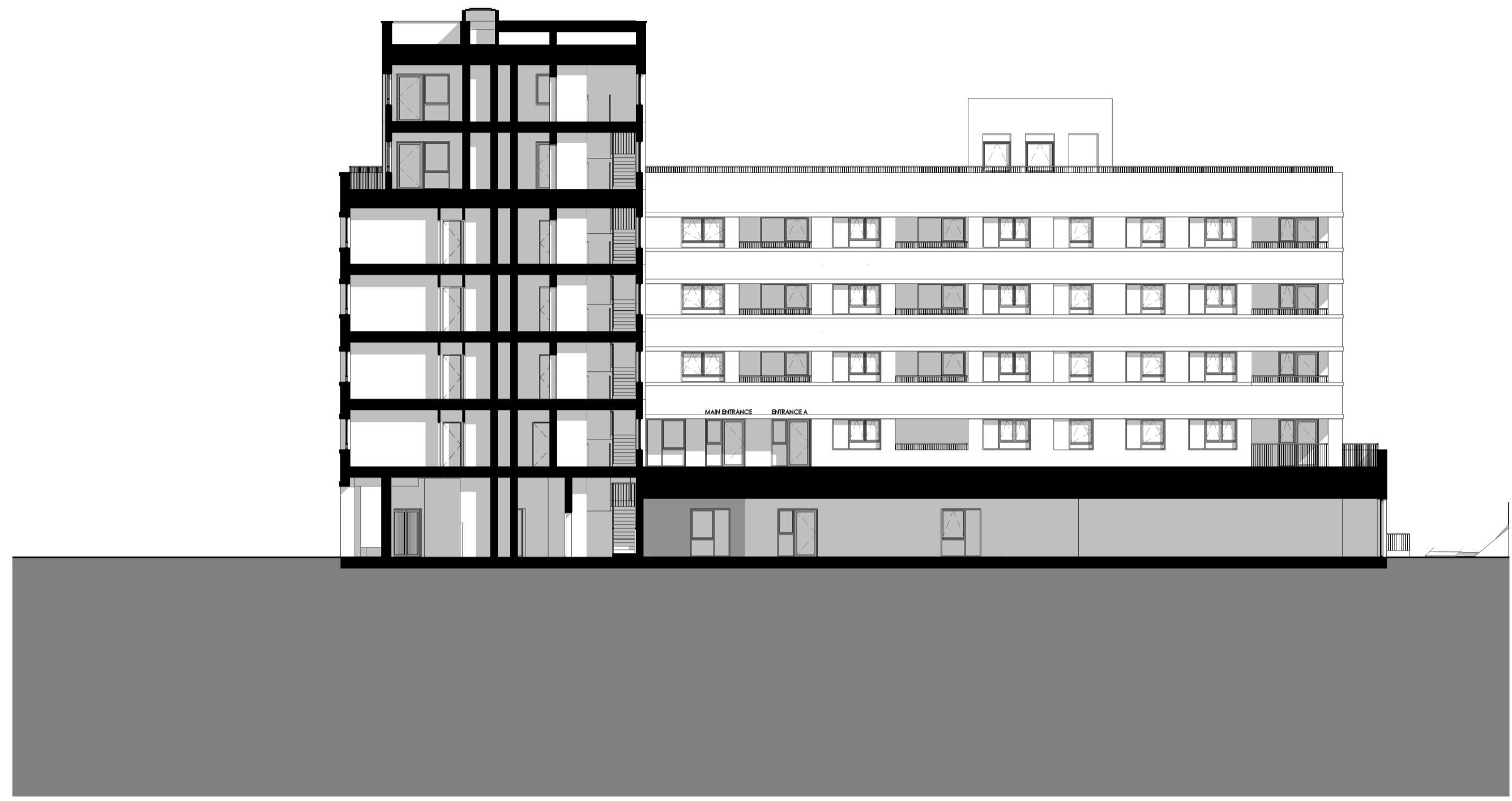
5 - South courtyard elevation (North) 1 : 200