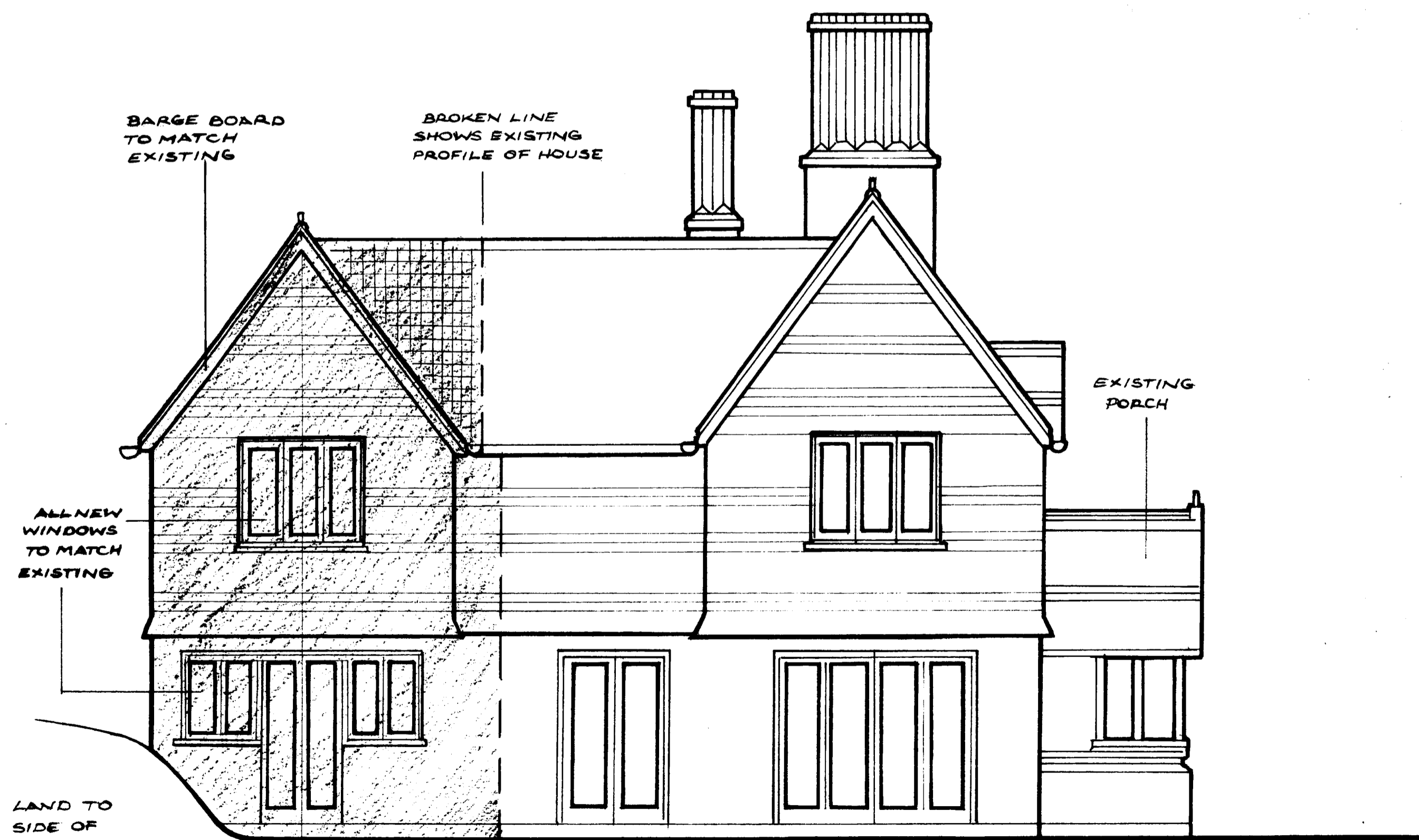
REAR ELEVATION S.W.

EXISTING GARAGE CONVERTED INTO HABITABLE ROOMS