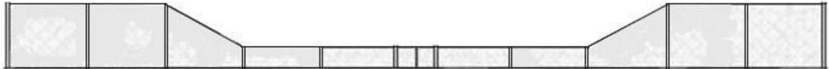
West Side Elevation – Length 35 metres – Height ranging from 2.75 metres down to 0.9 metres