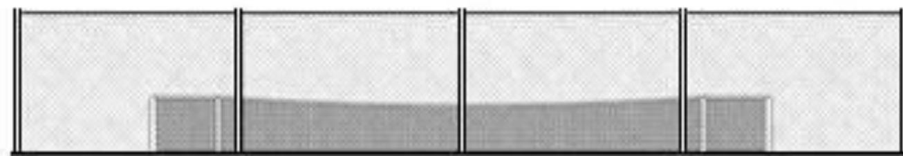
North End Elevation – Length 17 metres – Height 2.75 metres