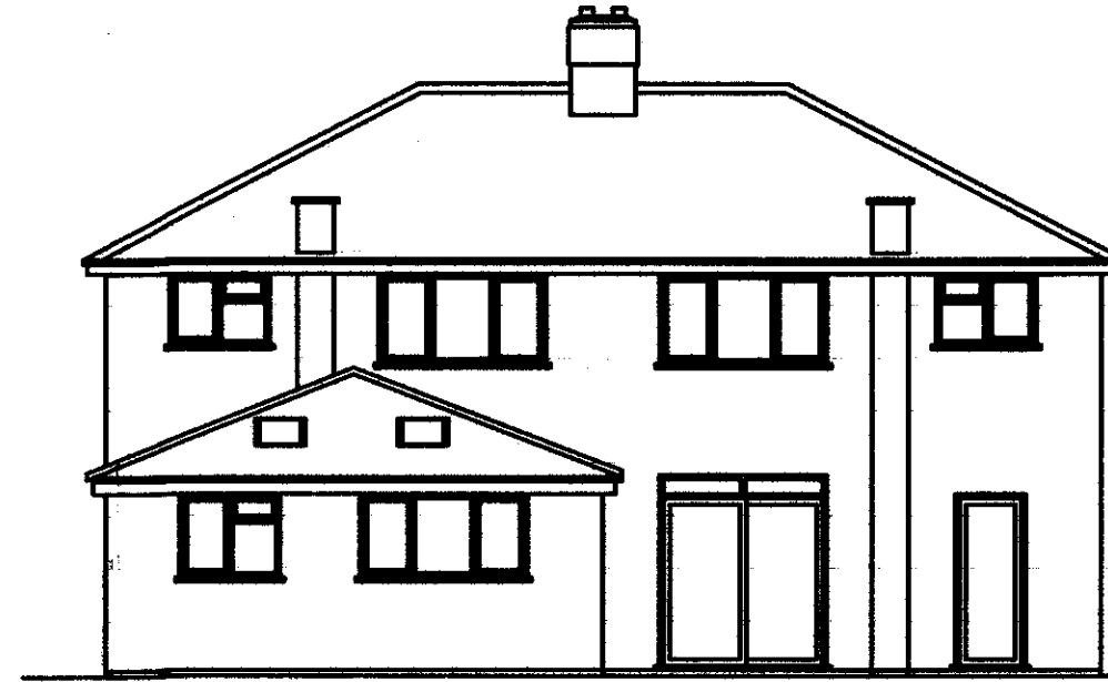
Proposed Rear Elevation (North)