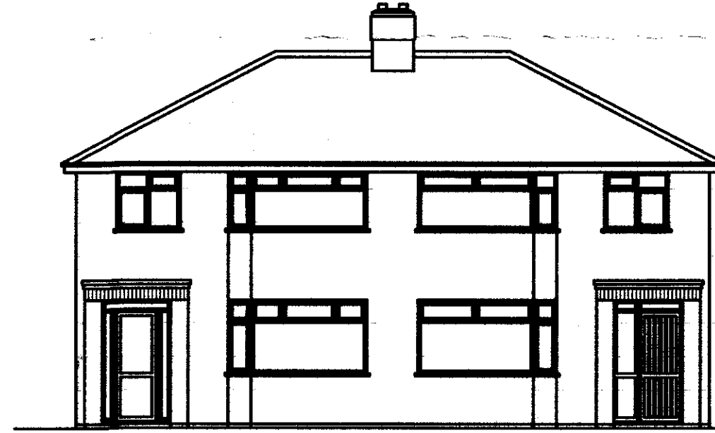
Proposed Front Elevation (South)