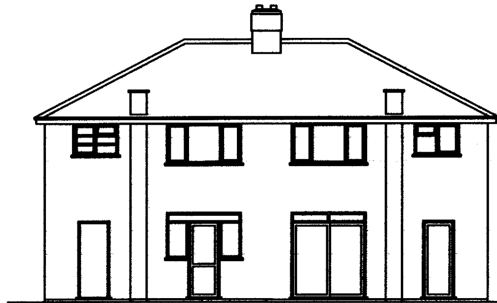
Existing Rear Elevation (North)