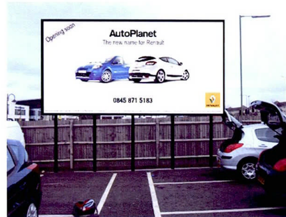
PHOTO MONTAGE TO APPROX SCALE FRONT ELEVATION FACING SW

A. 1no. DOUBLE SIDED TIMBER FRAMED PLYWOOD HOARDING MOUNTED ON STEEL POSTS TIMBER FRAME AND POSTS PAINTED BLACK, PLYWOOD PAINTED GLOSS WHITE. GRAPHICS WILL COMPRISE PRINTED POSTERS APPLIED TO FACE OF HOARDING. POSTERS WILL CHANGE. (EXAMPLE SHOWS TYPICAL MOTOR TRADE POSTER)