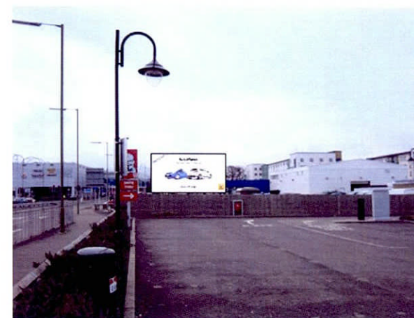
PHOTO MONTAGE TO APPROX SCALE REAR ELEVATION FACING NE

WELWYN HATFIELD PLANNING OFFICE COPY 04 JUN 2010 No: 200/1169