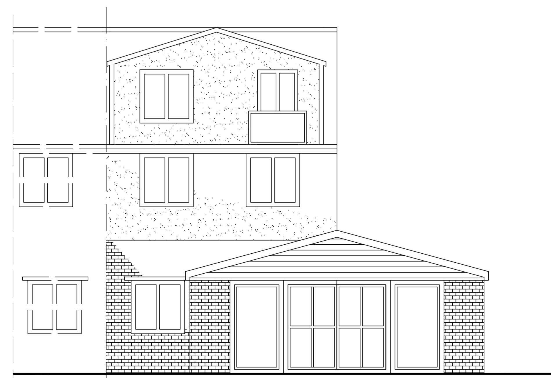
PROPOSED REAR ELEVATION (scale 1:50)