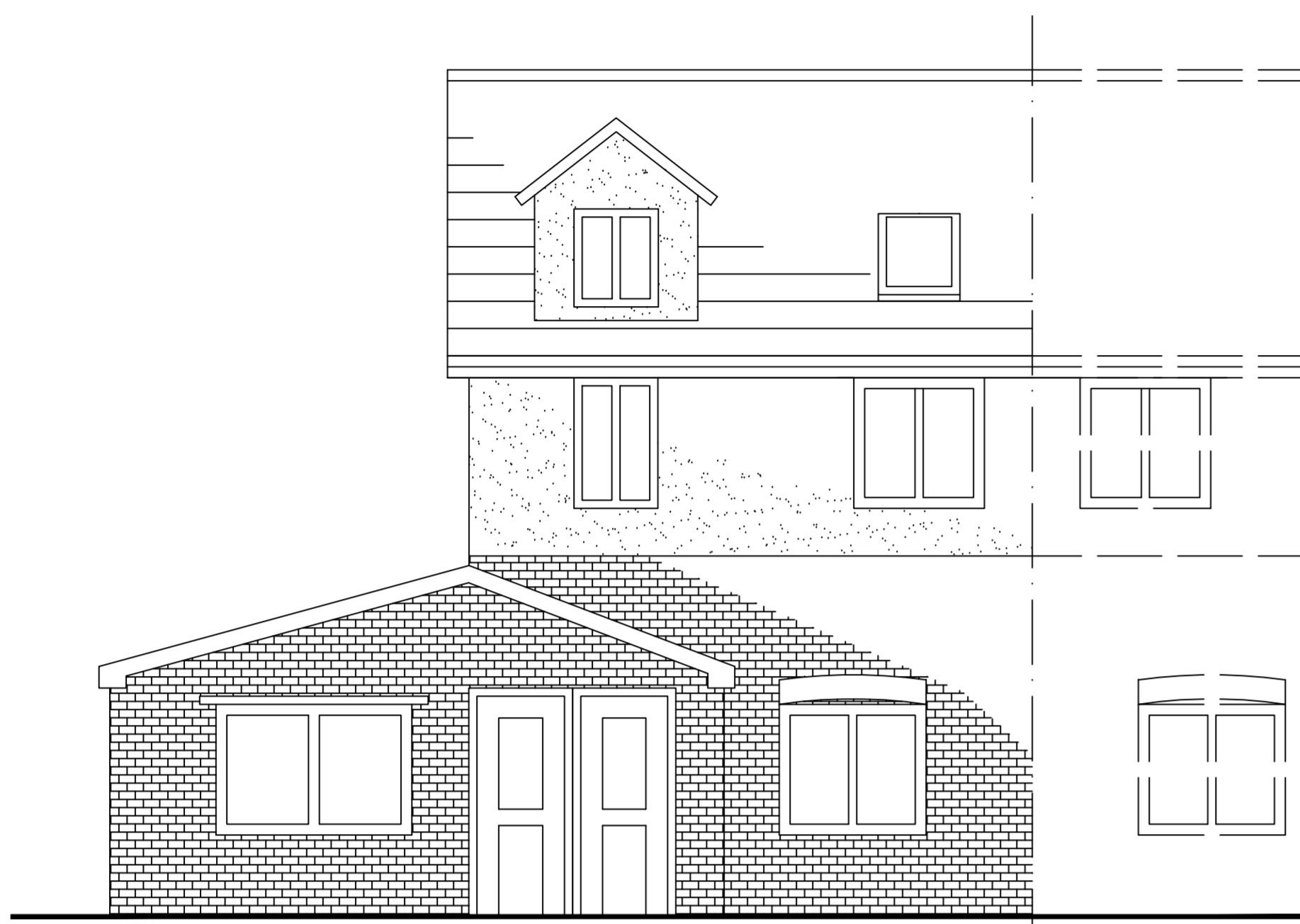
PROPOSED FRONT ELEVATION (scale 1:50)