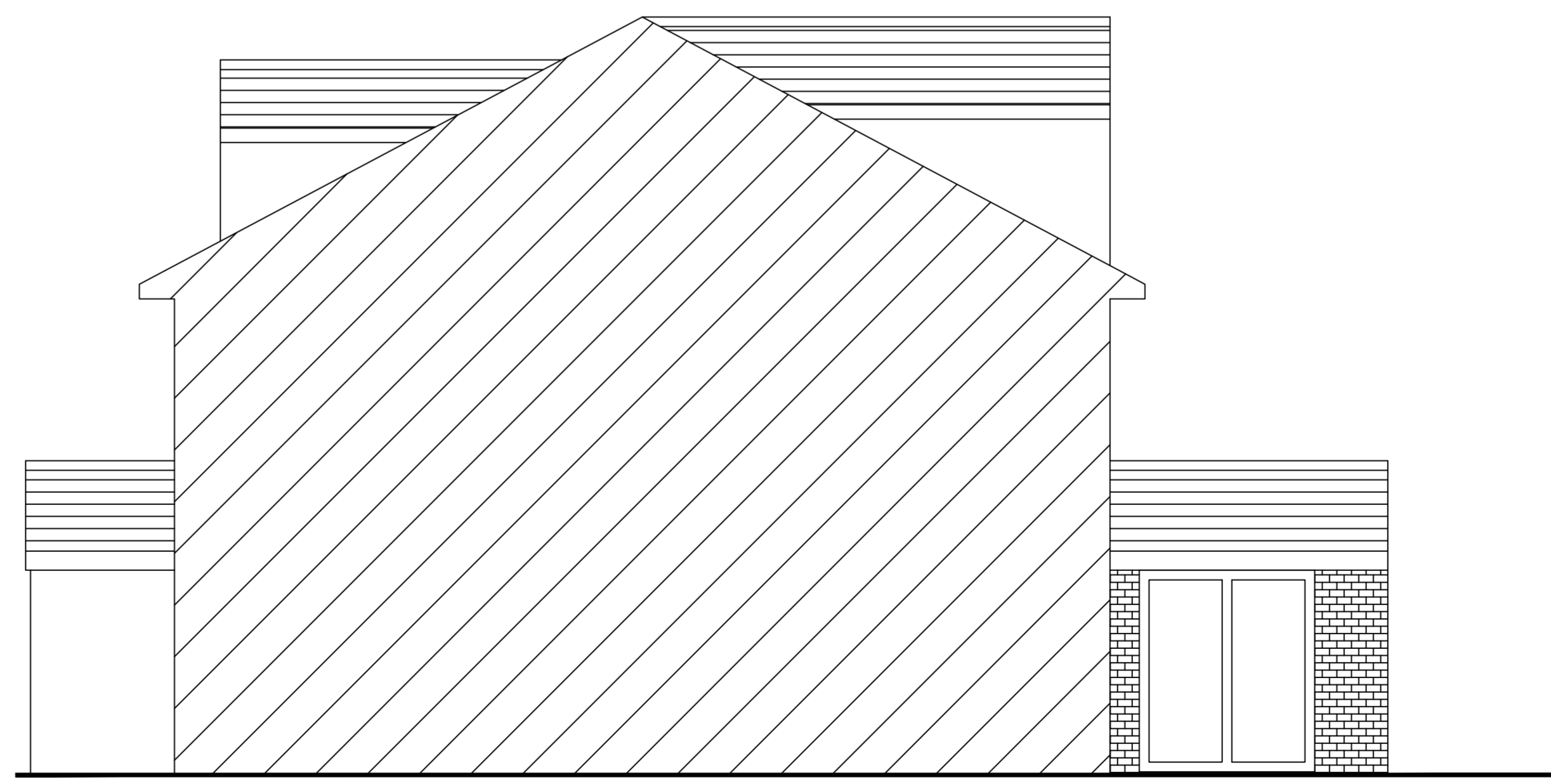
PROPOSED ADJ. SIDE ELEVATION (scale 1:50)