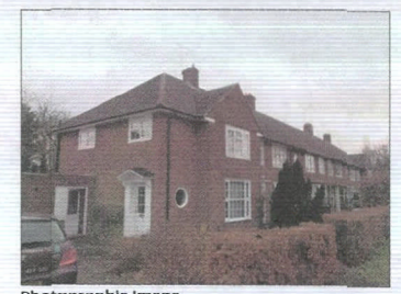
Photographic image Property as viewed from Parkway

NO. NOTES: THE CONTRACTOR MUST VERIFY THE DIMENSIONS AT THE SITE BEFORE COMMENCING ANY WORK OR PREPARING ANY SHOP DRAWINGS.