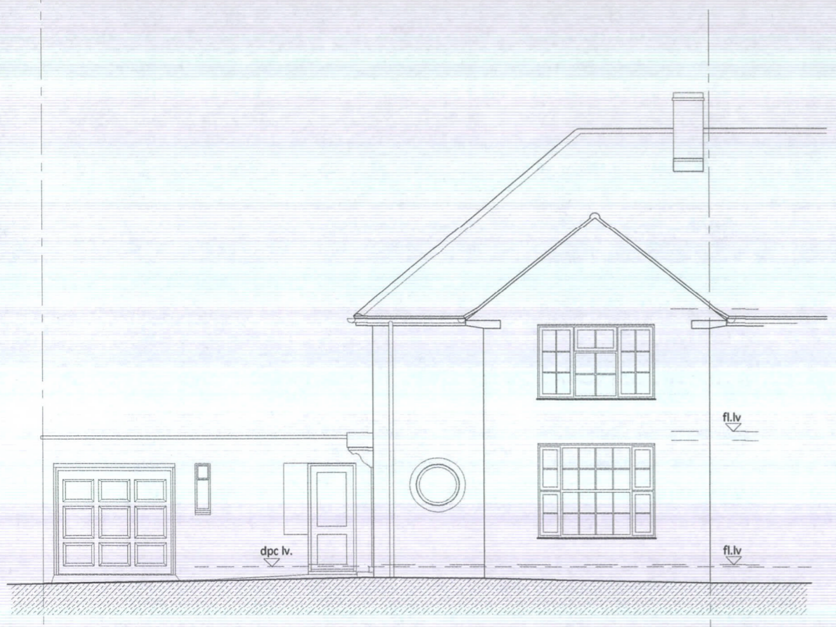
FRONT ELEVATION FACING S-W AS EXISTING