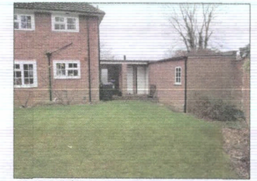
Photographic image Property as viewed from rear garden