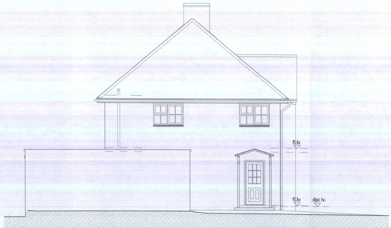
SIDE ELEVATION FACING N-W AS EXISTING