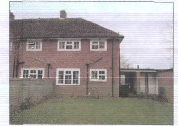
Photographic image Property as viewed from rear garden