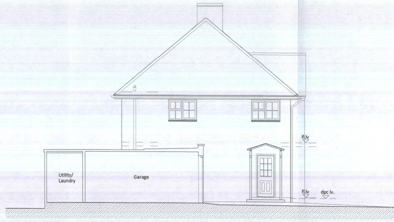
SIDE ELEVATION / SECTION THROUGH GARAGE FACING N-W AS EXISTING