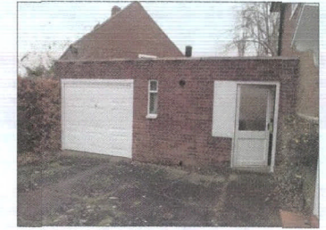
Photographic image Property as viewed from Parkway