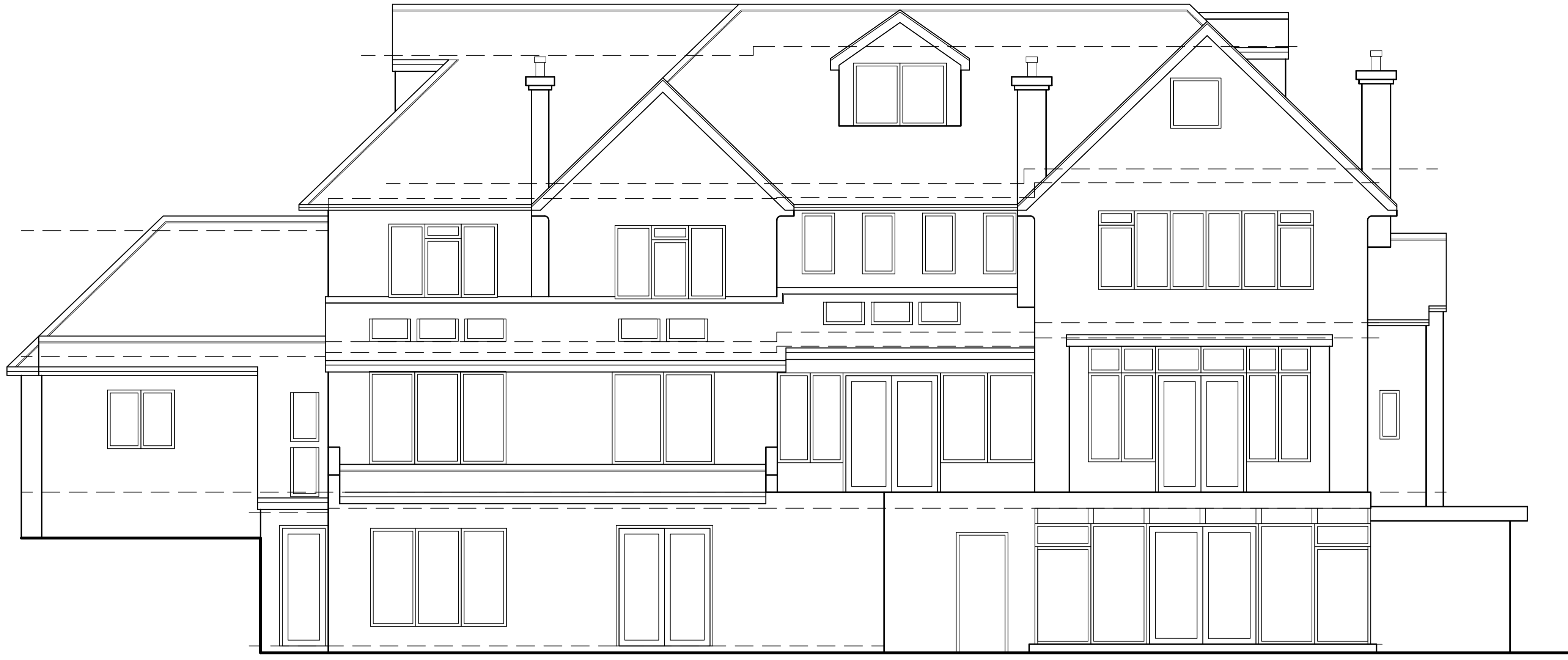
EXISTING REAR ELEVATION (scale 1:50)