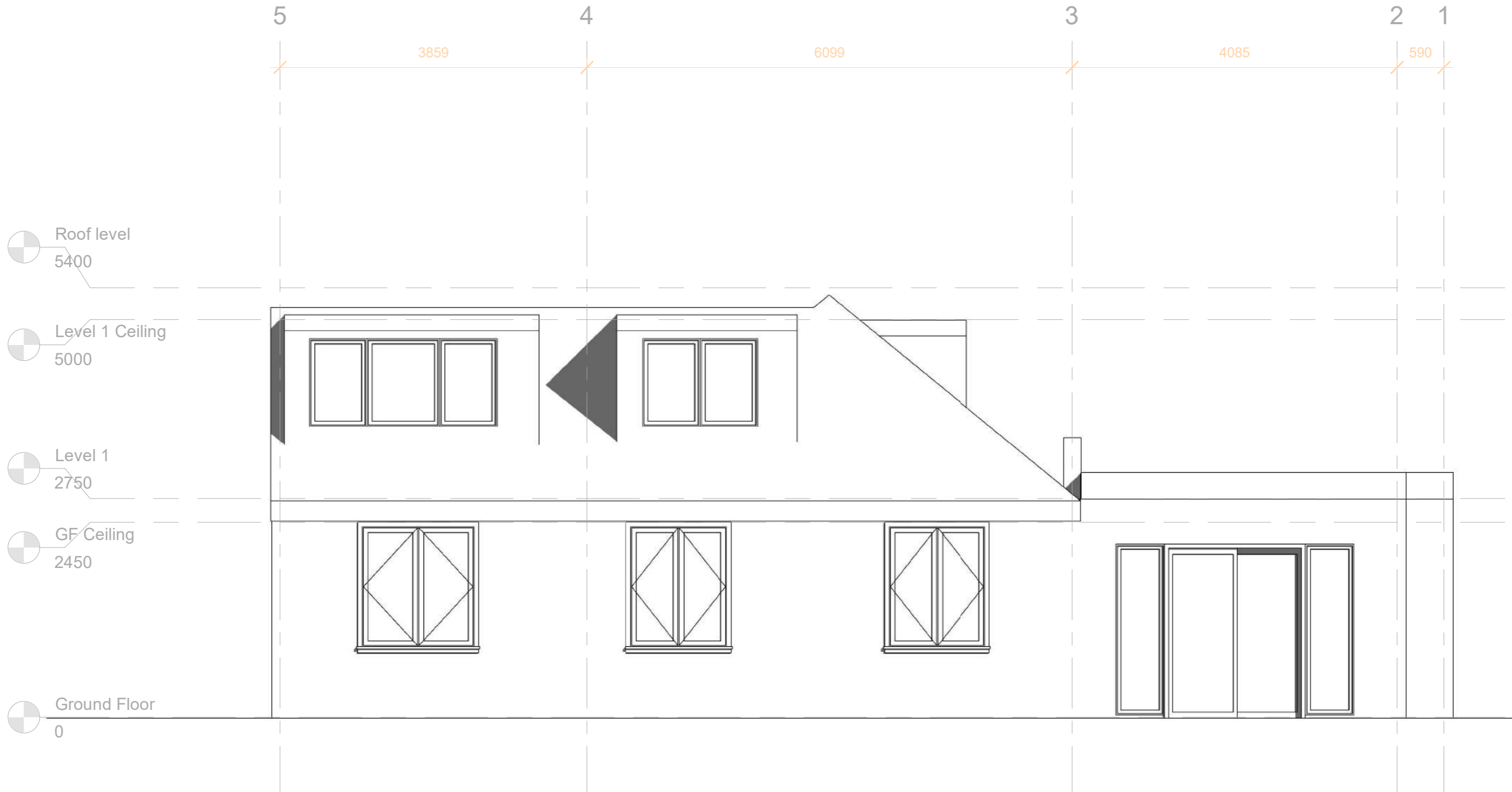
1 E - Rear Elevation 1 : 50