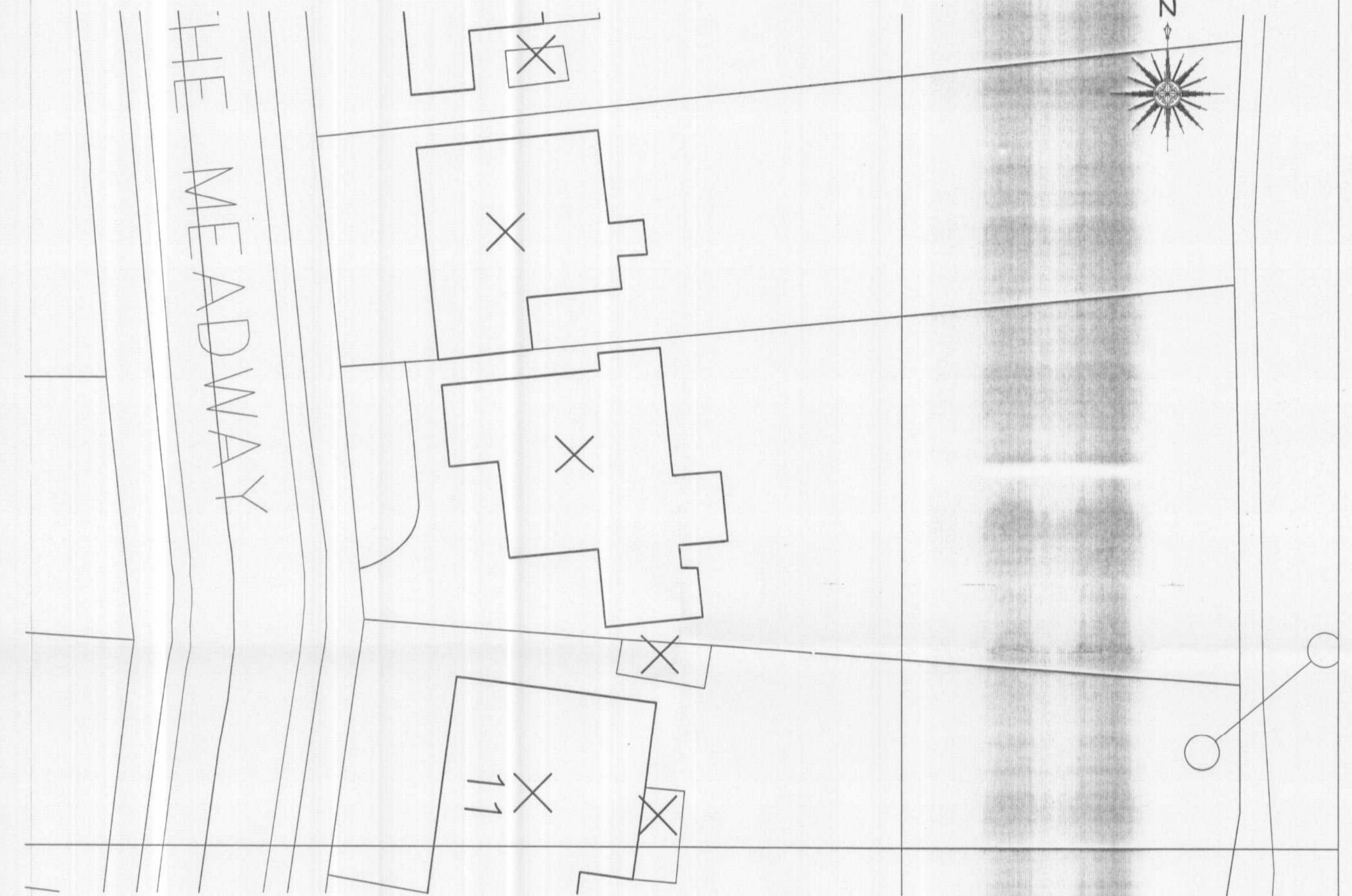
Existing Site Plan Scale 1:200