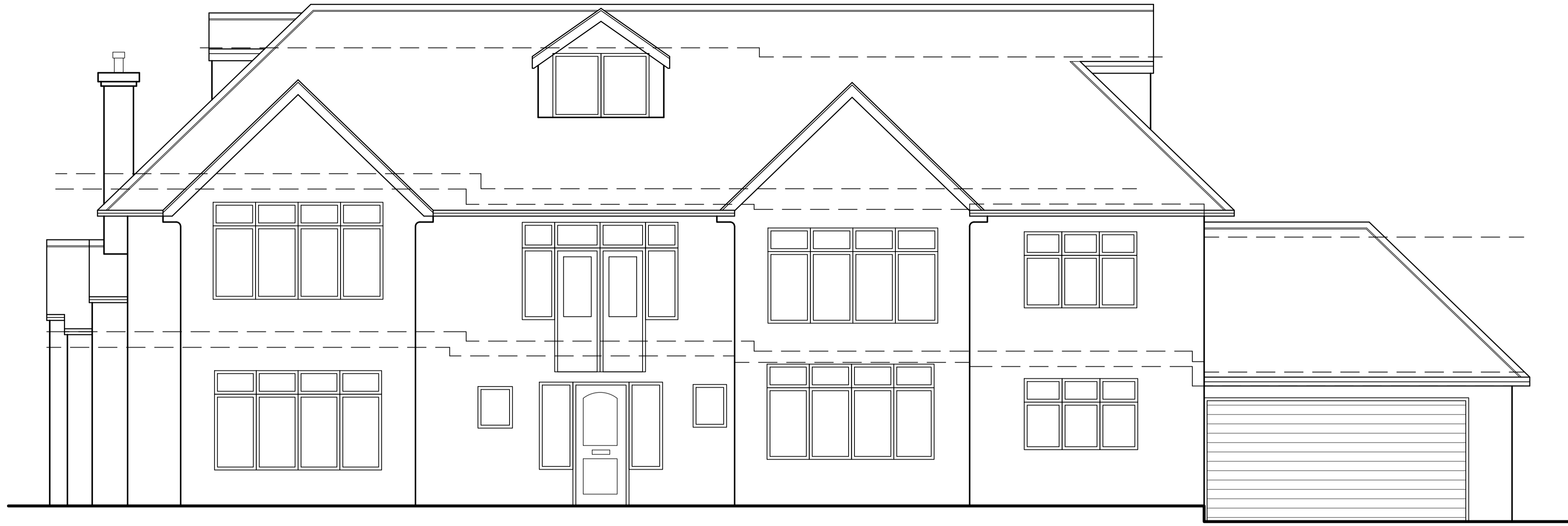
EXISTING FRONT ELEVATION (scale 1:50)