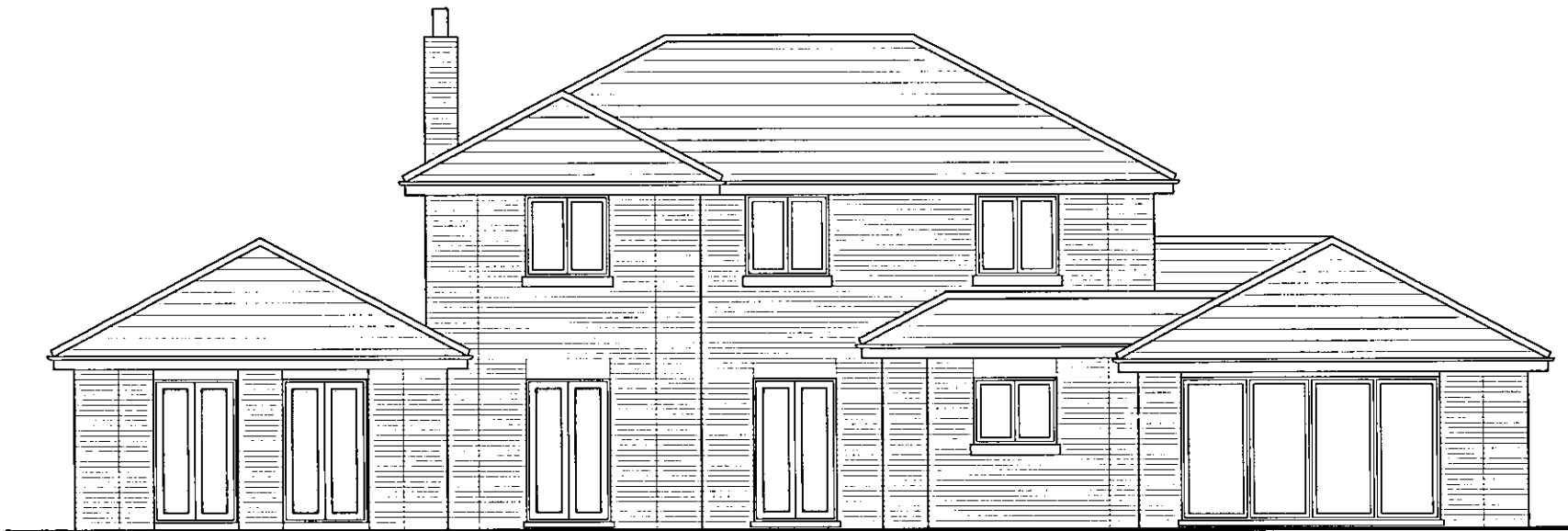
EXISTING GARDEN ELEVATION 1:100