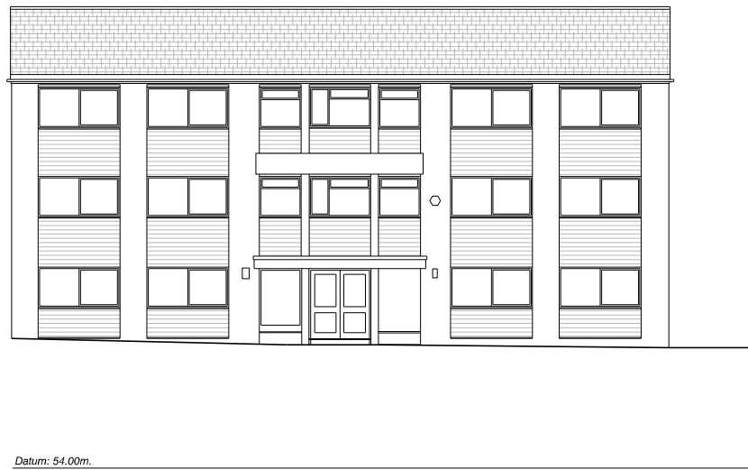
01 Existing Elevation 1 1:200@A3