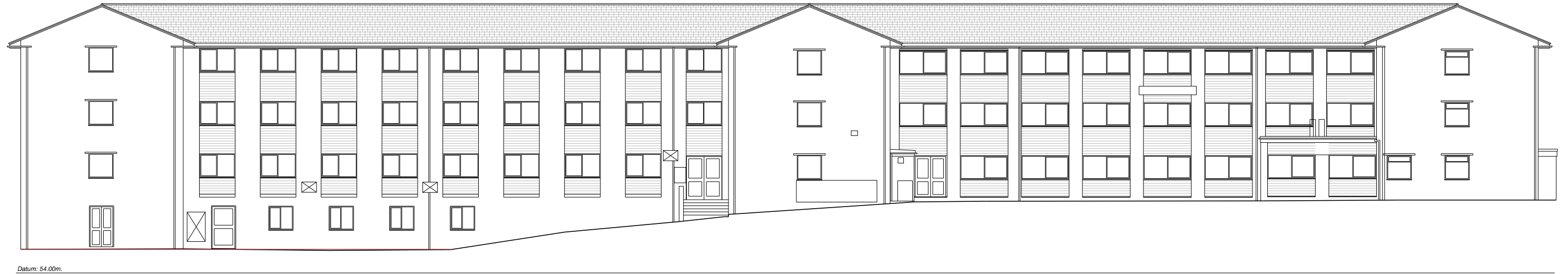
02 Existing Elevation 2 1:200@A3