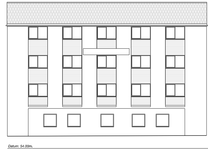
03 Existing Elevation 3 1:200@A3