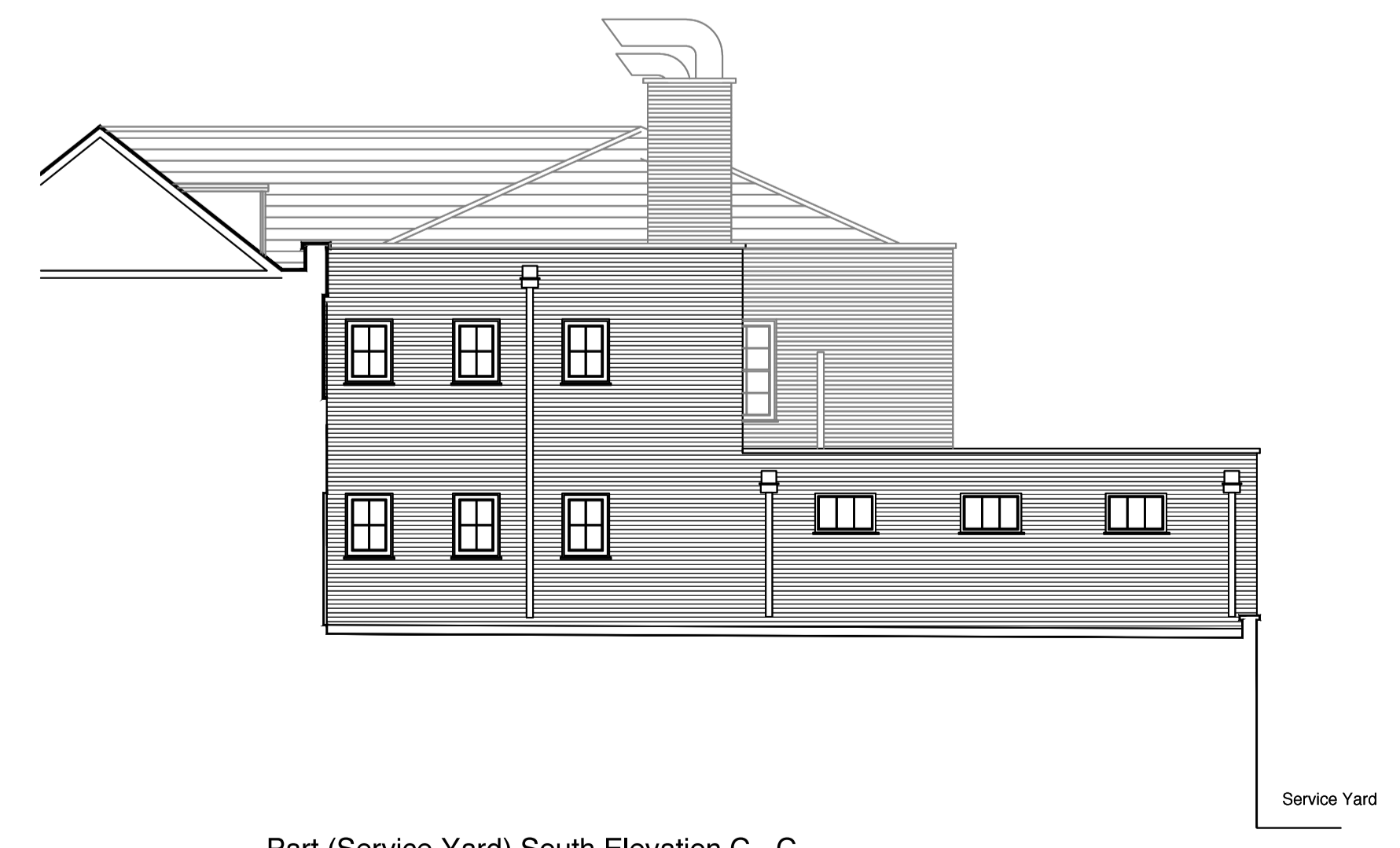
Part (Service Yard) South Elevation C - C