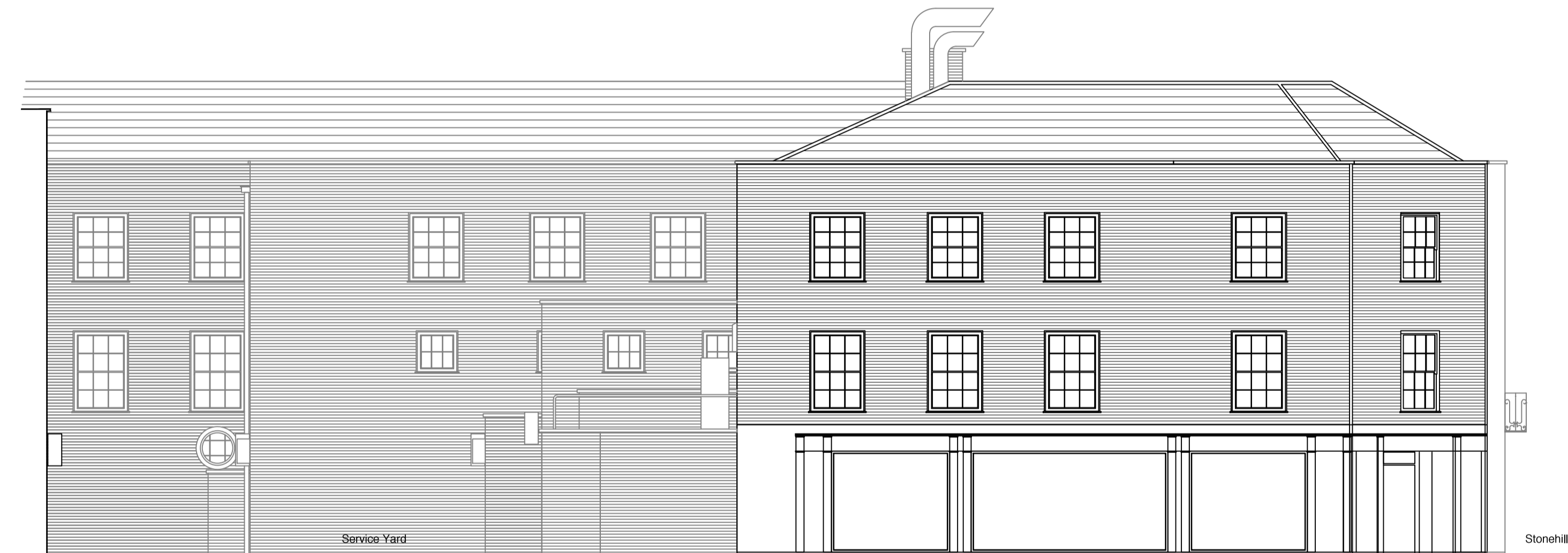
Stonebank North Elevation