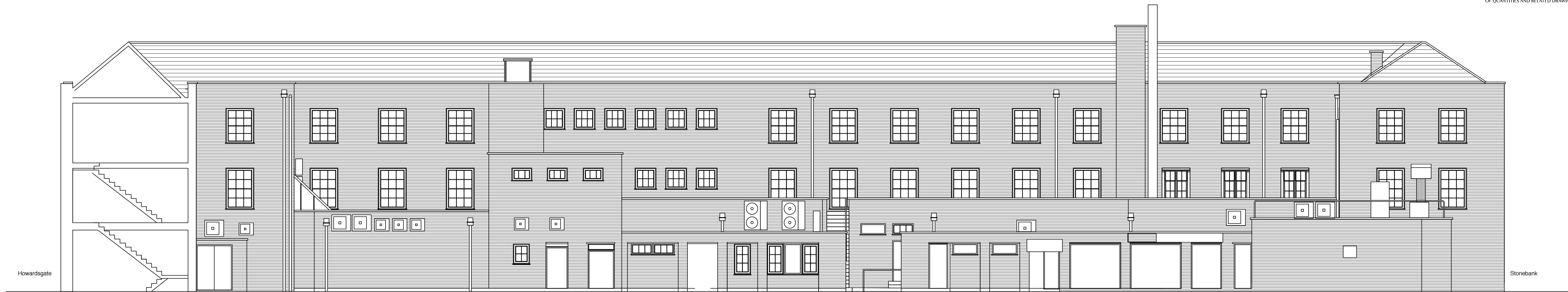
Rear (Service Yard) East Elevation