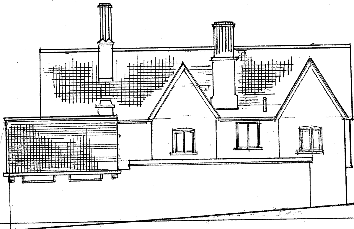
N.W. SIDE ELEVATION EXISTING