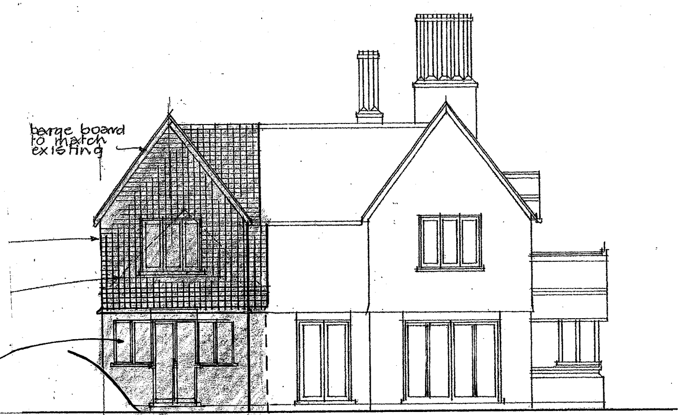
REAR S.E ELEVATION

new tile hung gabled 1st floor with decorative tile hanging to match existing existing pitched roof over front garage section removed new glazing to rear