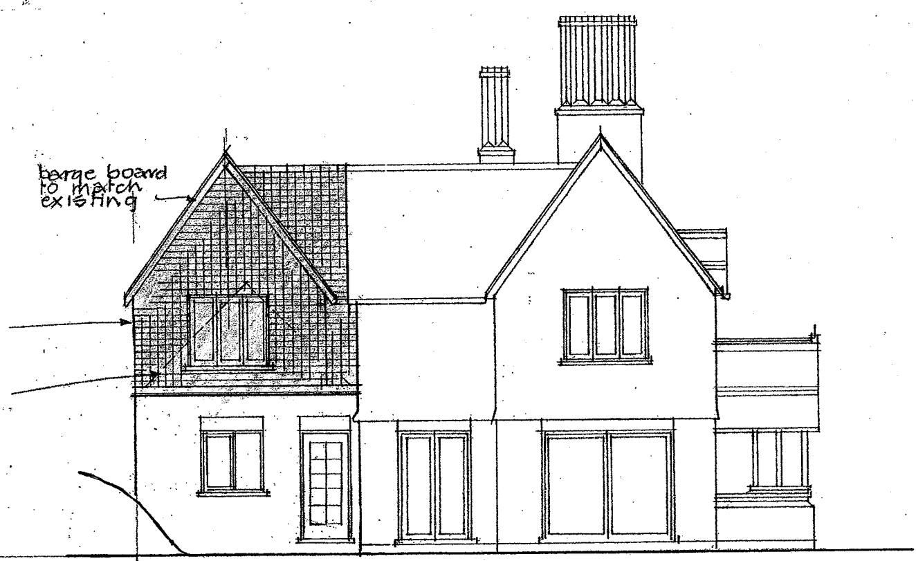
REAR S.E ELEVATION

new tile hung gabled 1st floor with decorative tile hanging to match existing existing pitched roof over front garage section removed