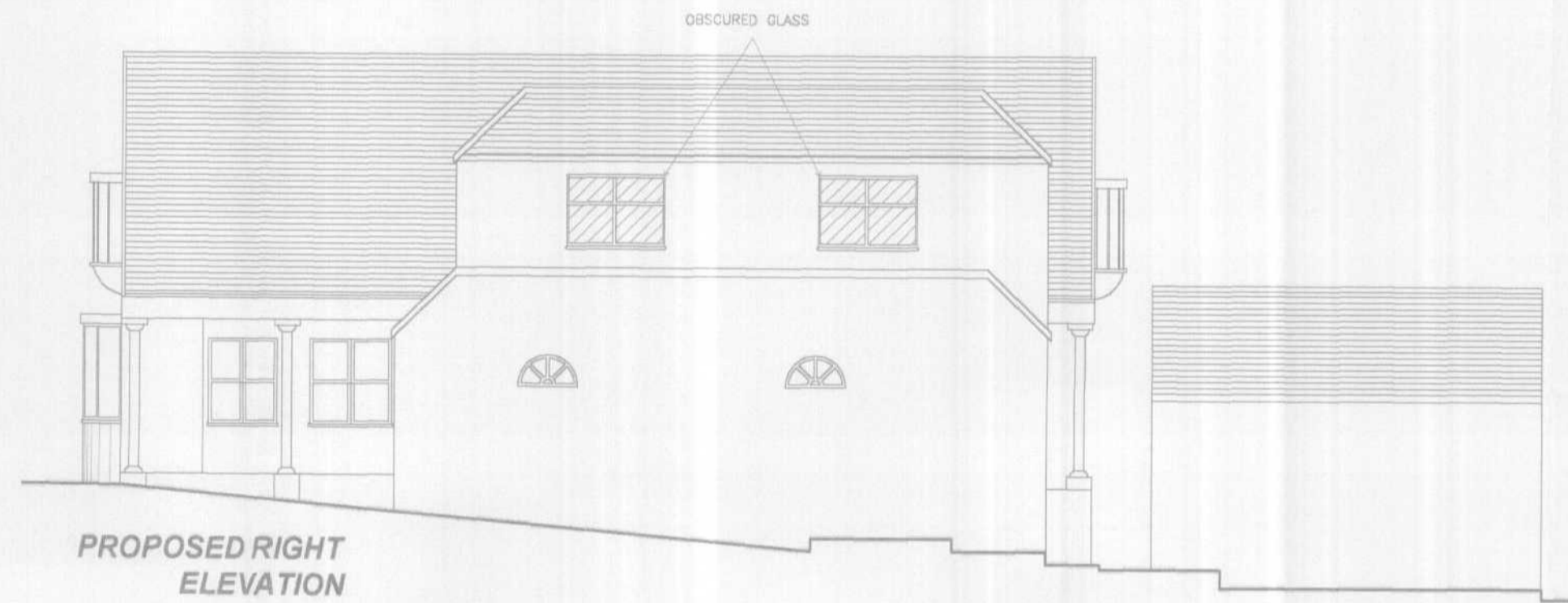
PROPOSED RIGHT ELEVATION