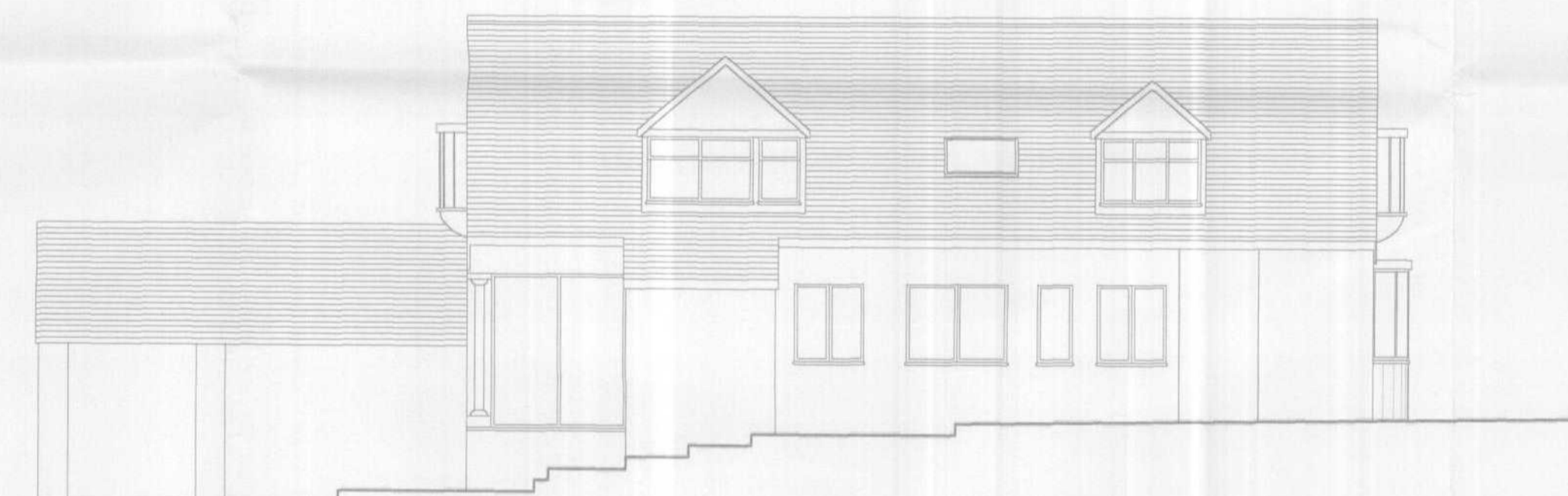
EXISTING LEFT ELEVATION