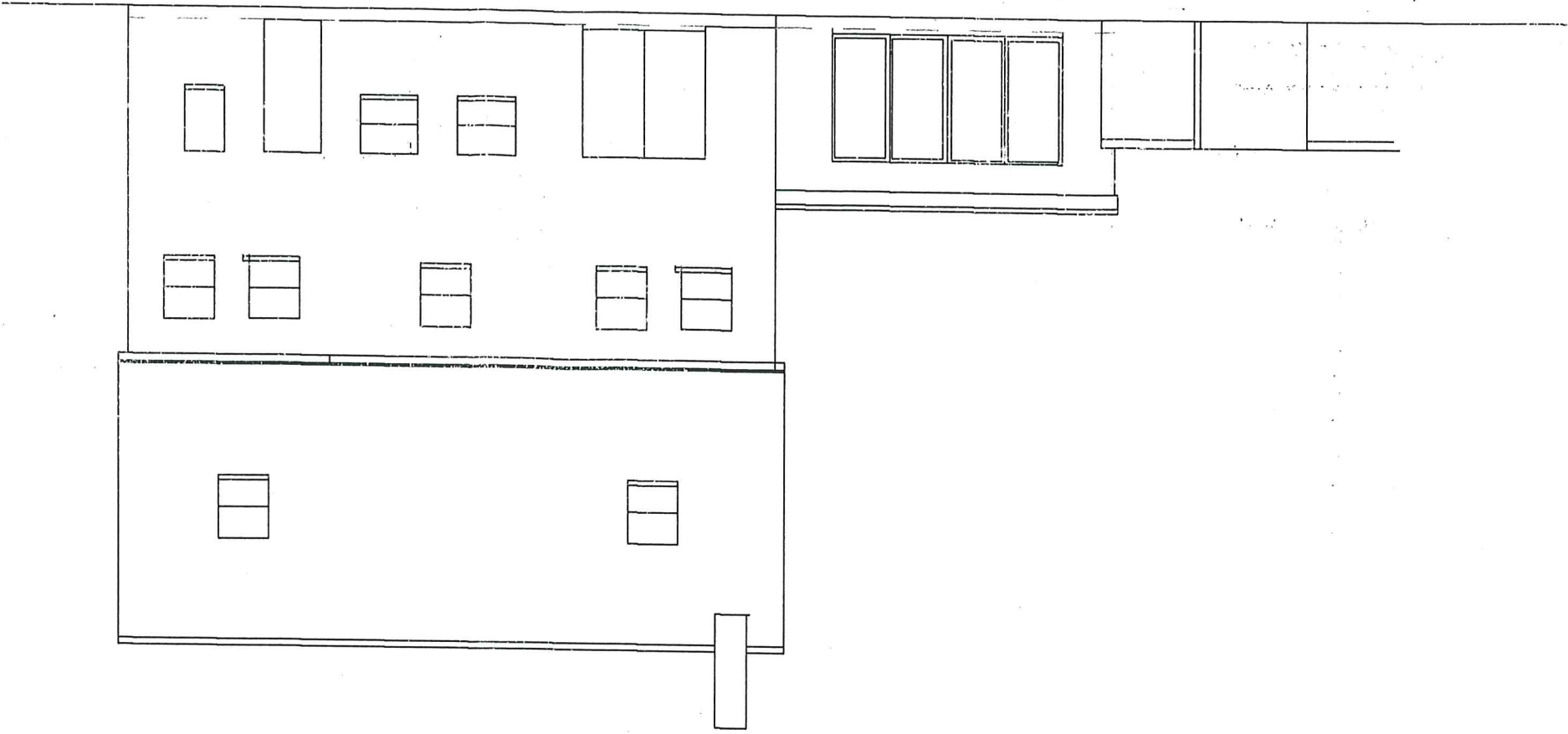
Front Elevation Proposed