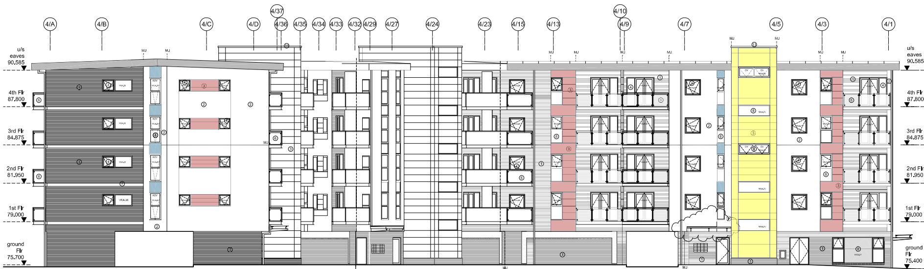
Elevation 3 - North West Elevation of Block 4