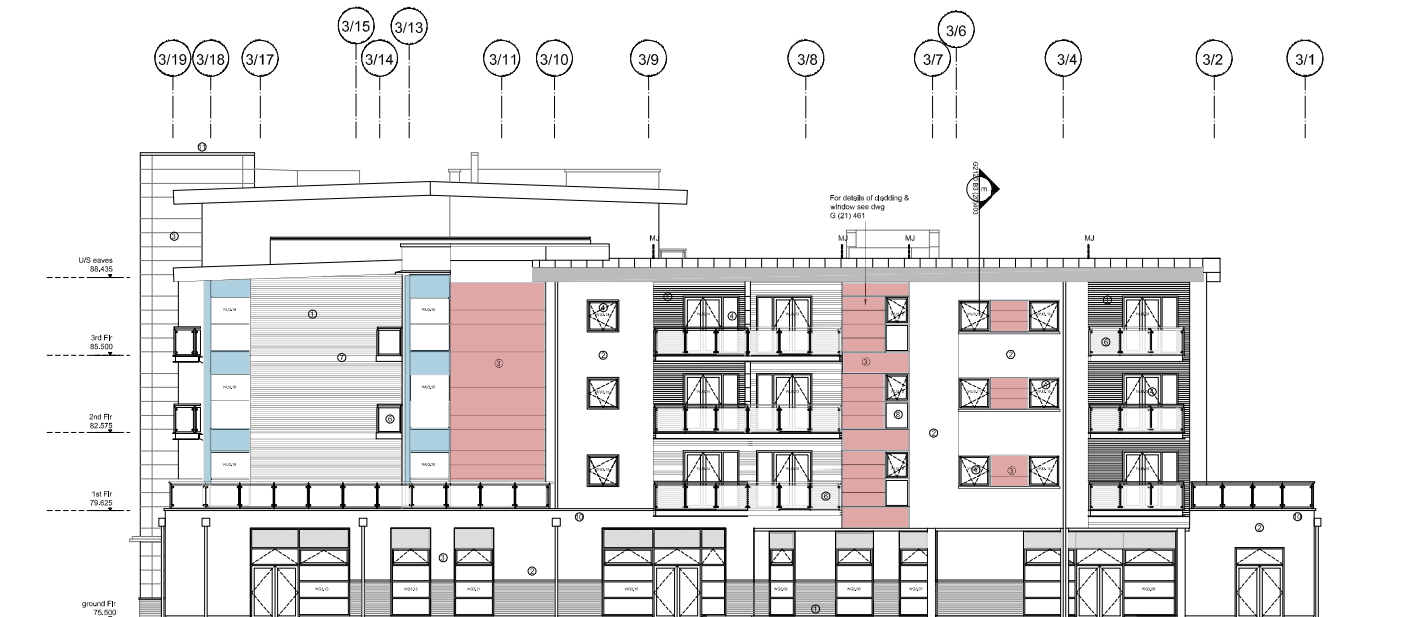
Elevation 3 (North West)