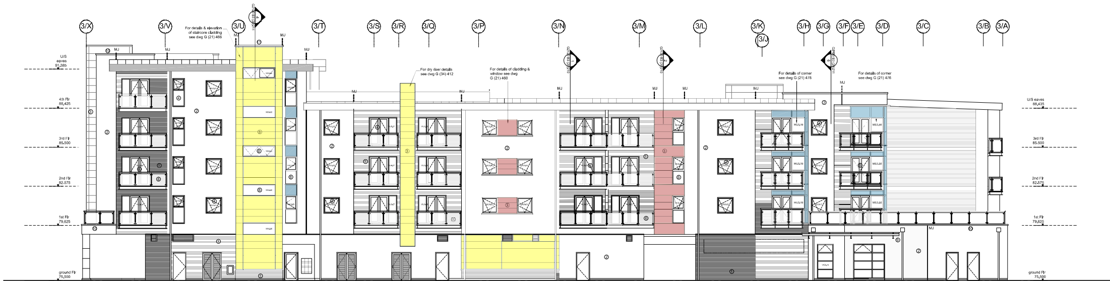
Elevation 4 (North East)