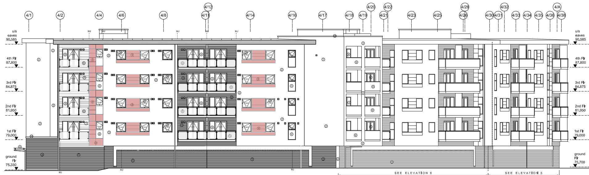
Elevation 1 - South East Elevation of Block 4