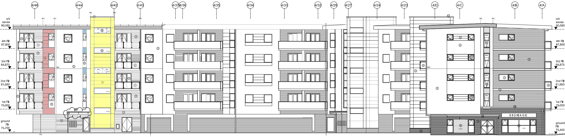
Elevation 2 - South West Elevation of Block 4