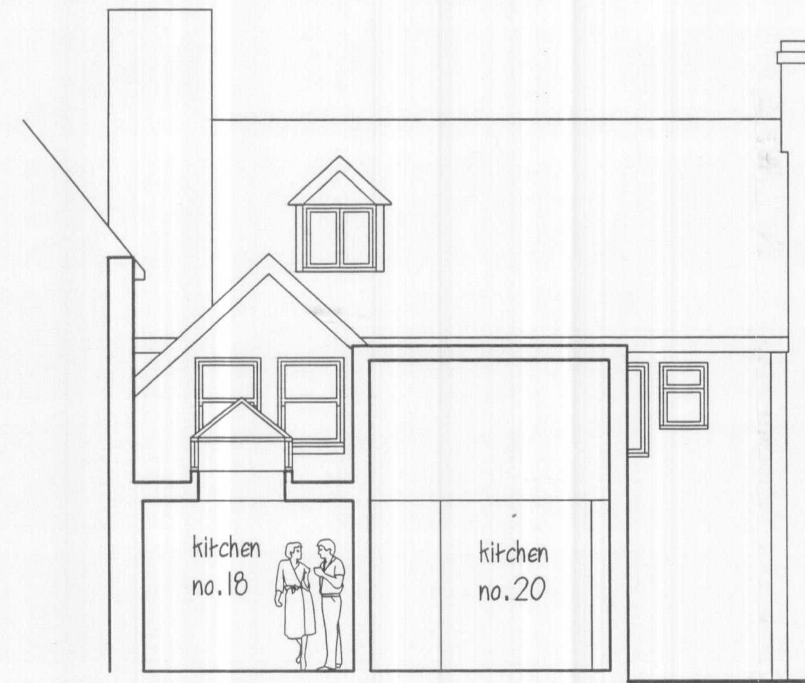
SECTION THROUGH KITCHEN AREAS