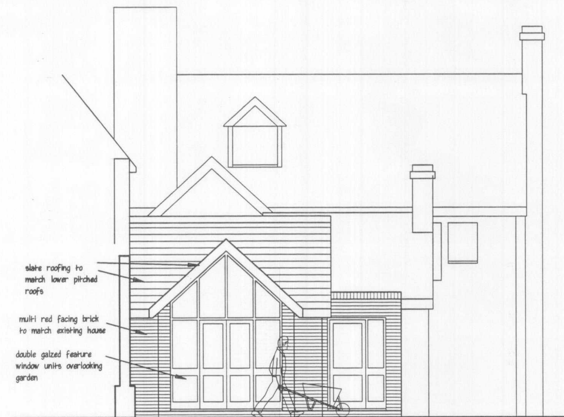
18/20 FORE STREET OLD HATFIELD SECTIONS ELEVATION to garden